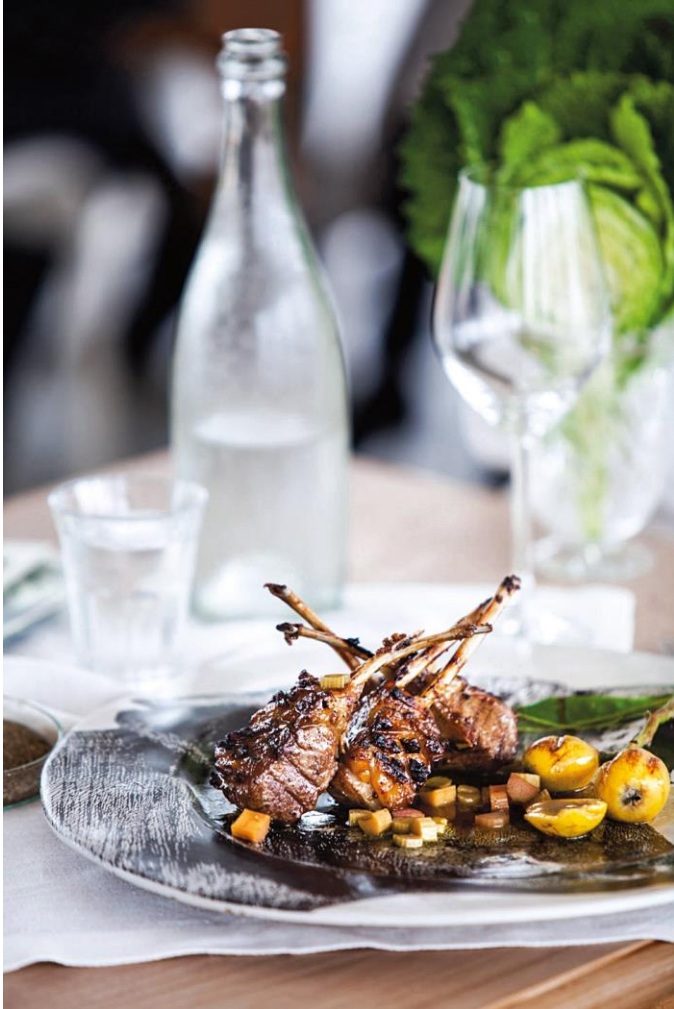
Babylonstoren Crookes & Jackson