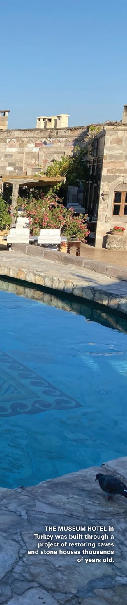
THE MUSEUM HOTEL in Turkey was built through a project of restoring caves and stone houses thousands of years old.

Traveling and planning a trip during the age of COVID-19 is a challenge but also has certain perks. We have just completed two weeks in Turkey, where we were able to experience some of the best of the country without the crowds but with all safety precautions in place.