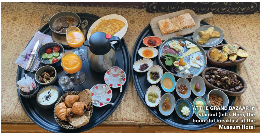
AT THE GRAND BAZAAR in Istanbul (left). Here, the bountiful breakfast at the Museum Hotel