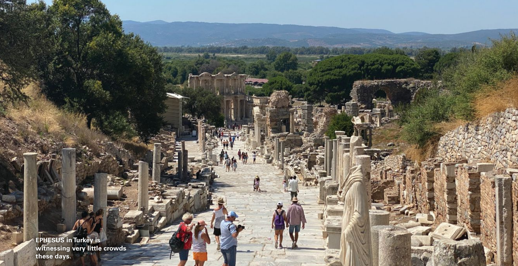
EPHESUS in Turkey is witnessing very little crowds these days.

Jaguar to a follow up within seconds (even finding you in the restaurant) to take care of any issues — this hotel really shines.