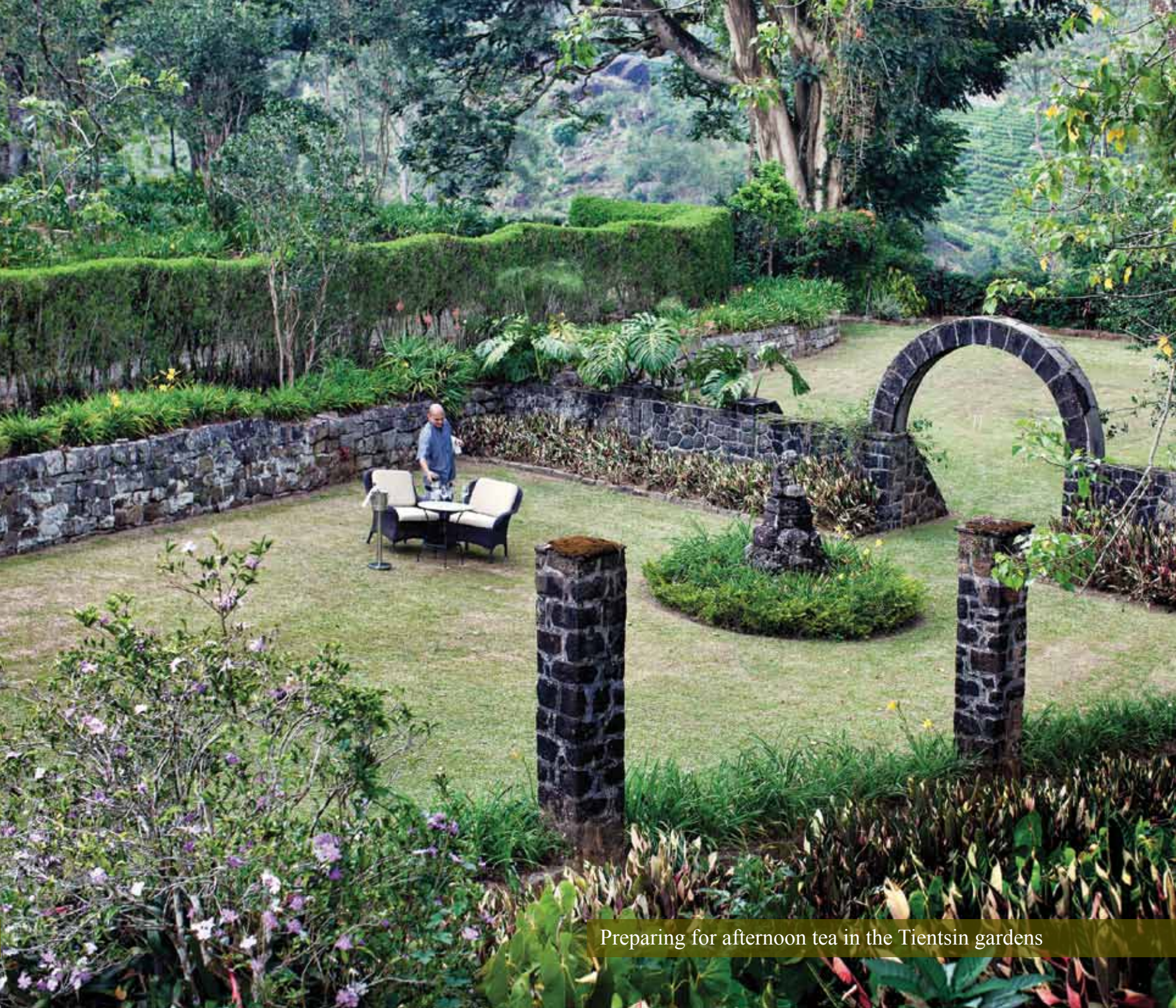
Preparing for afternoon tea in the Tientsin gardens