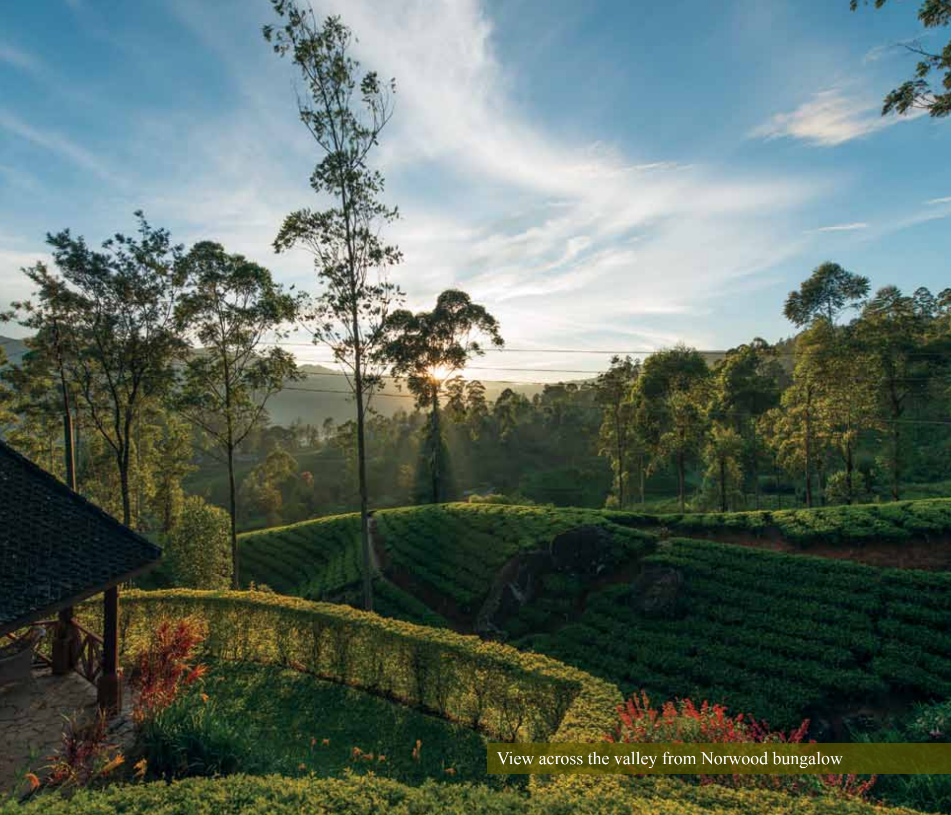
View across the valley from Norwood bungalow