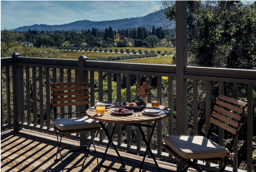
A picturesque morning at Meadowood Napa Valley, featuring garden-driven cuisine and breathtaking vineyard views.

Inspirational destinations & properties of excellence