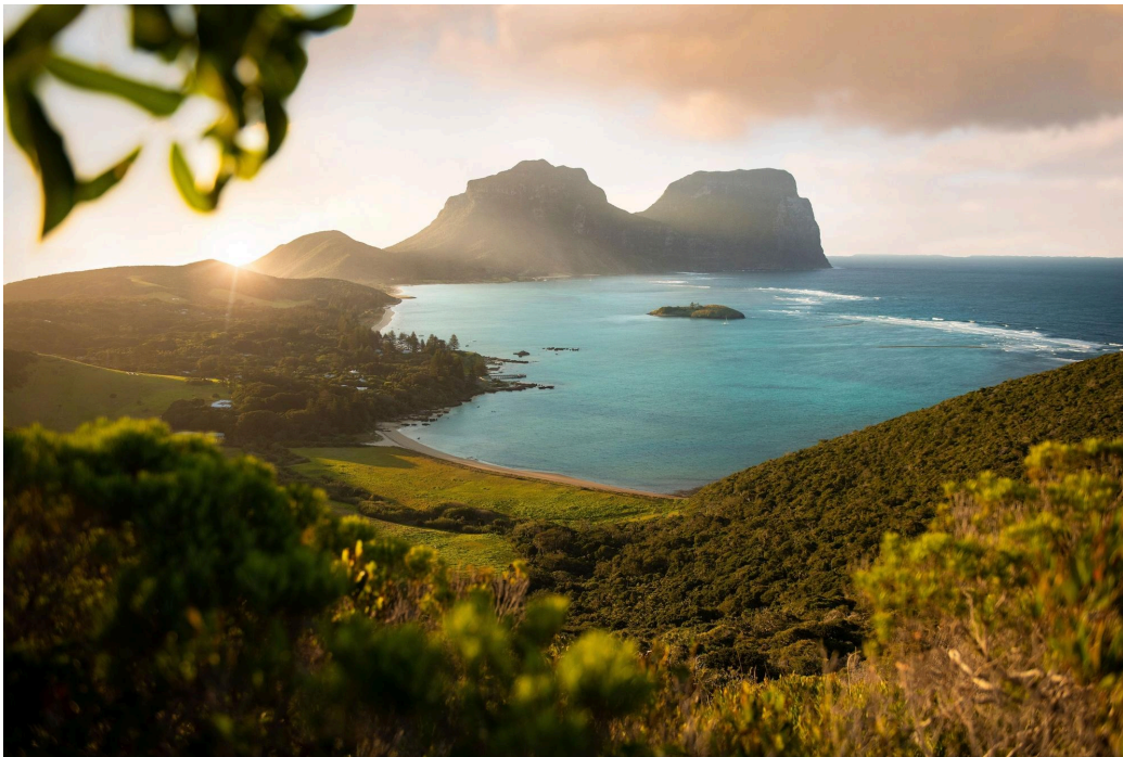
World Heritage views and turquoise lagoons: finding tranquility on Lord Howe Island, where nature sets the pace and visitor numbers are strictly capped.

Those who venture even further afield and are keen to explore some of Australia's hidden gems are also spoilt for choice, with options such as: