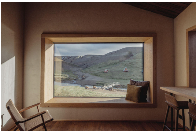
A geothermal panorama: Kerlingarfjöll Mountain Resort.

At the heart of this remote landscape lies Kerlingarfjöll, a geothermal wonder of steaming valleys, rhyolite mountains, and raw, shifting colors. Here, far from the main travel routes, the experience becomes quieter and more immersive.