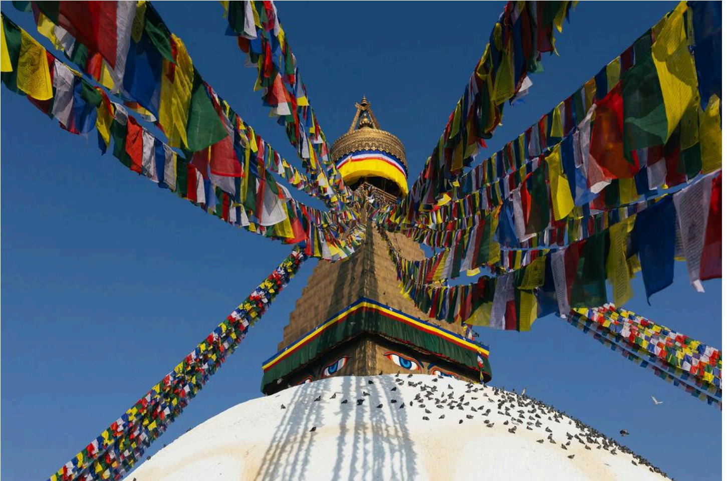
A rainbow of blessings. The simple, raw, and authentic beauty of a Nepalese temple under a canopy of vibrant prayer flags.