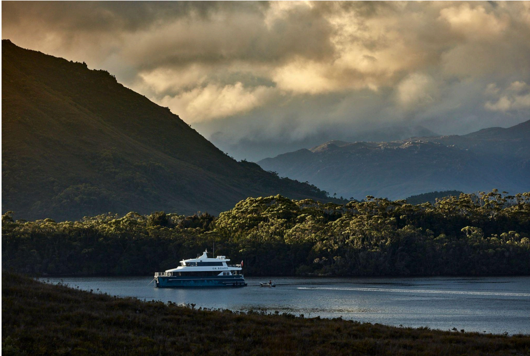
An untamed luxury experience: Exploring Tasmania's UNESCO World Heritage wilderness regions aboard the floating luxury lodge, Odalisque III, which accommodates just 12 guests.

The Grampians: Send travelers on the inland route back to Melbourne after touring the iconic Great Ocean Road to discover world-class dining, wonderful wilderness hikes, a collection of native wildlife (kangaroos, wallabies, emus, brightly colored parrots, and more), and beautiful boutique accommodations.