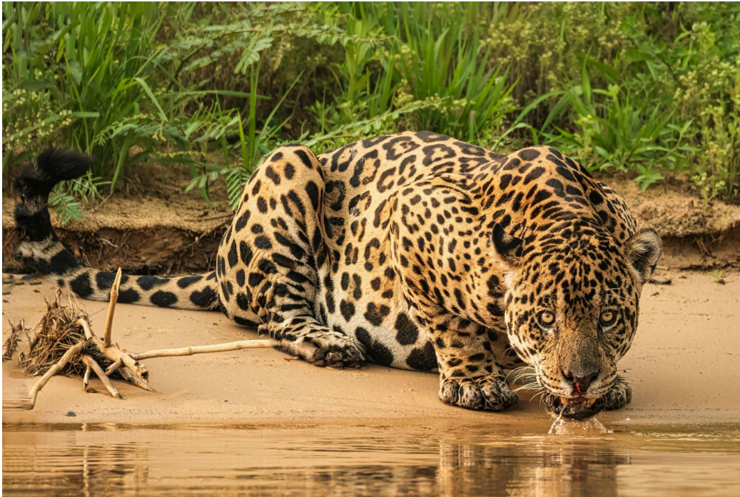
A majestic jaguar, perfectly poised on a riverbank, watches over its domain in the untouched wilderness of Brazil's Pantanal—the world's largest tropical wetland.

Inspirational destinations & properties of excellence