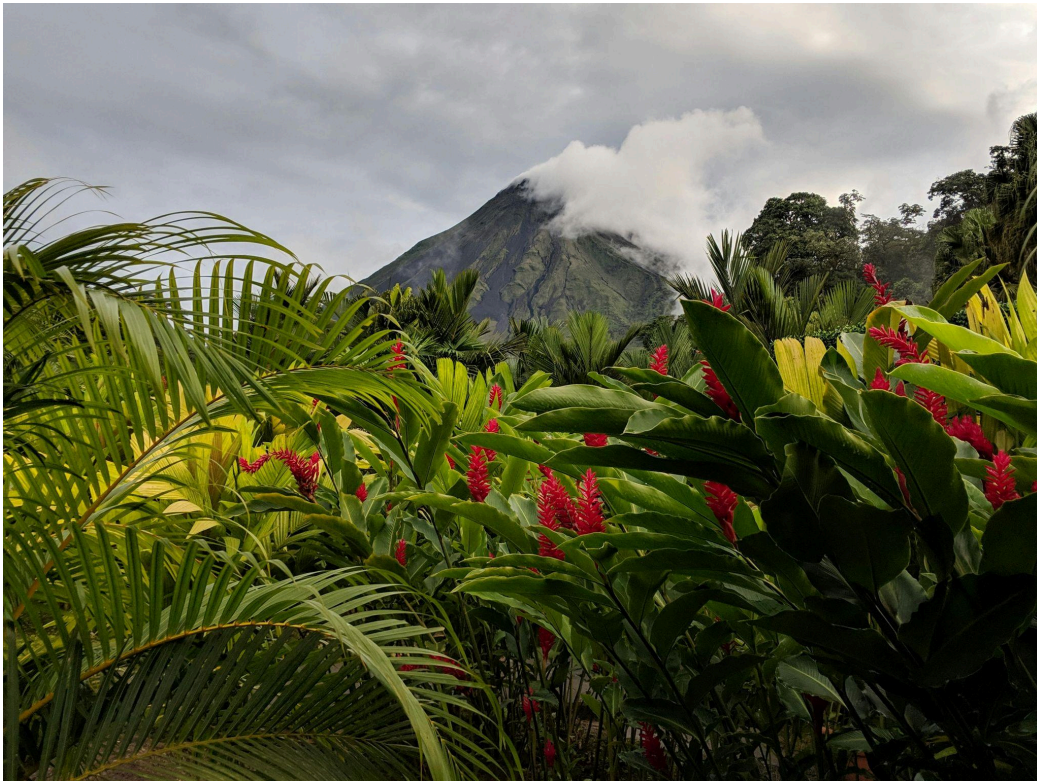
The majestic Arenal Volcano, a defining landmark above the lush Northern Region of Costa Rica, where nature and adventure converge.