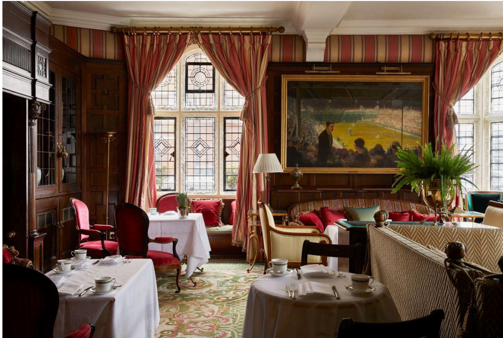
Centre Court style meets Kensington elegance. A timeless portrait celebrating the greatest grass-court event, only at The Milestone.

Inspirational destinations & properties of excellence