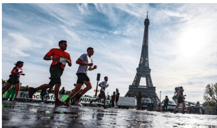
26.2 miles of history and passion, with the Eiffel Tower marking every magnificent stride in the heart of Paris.

Some journeys begin with a destination. Others begin with a moment. In France, the calendar of great sporting and cultural events offers exactly that: moments that transform travel into something vivid, emotional, and unforgettable.