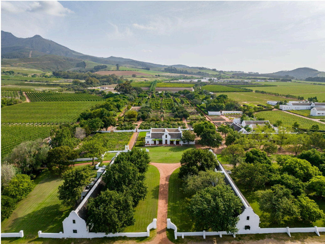
A view that places you fully: grounded in the land, surrounded by the majesty of the Simonsberg Mountains and rolling Cape Winelands vineyards.

Inspirational destinations & properties of excellence