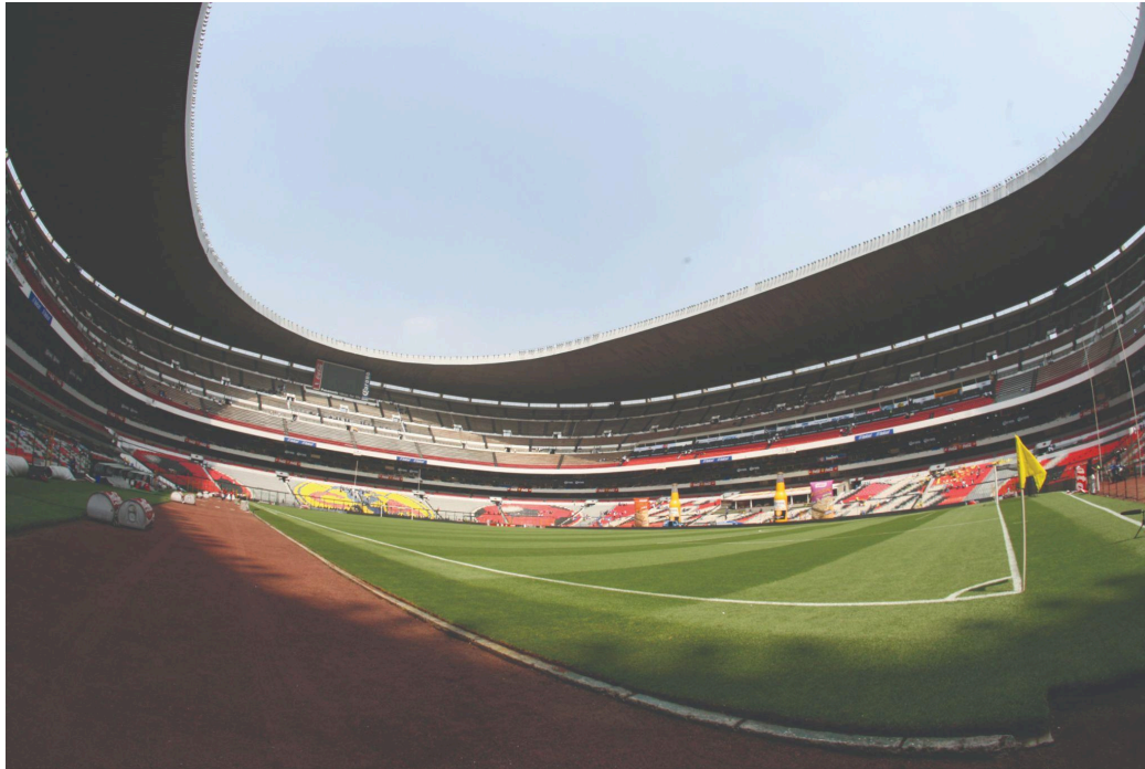
Estadio Azteca, Mexico City: The legendary pitch where Pelé (1970) and Maradona (1986) made history, and the host of the 2026 FIFA World Cup opening match.

Inspirational destinations & properties of excellence