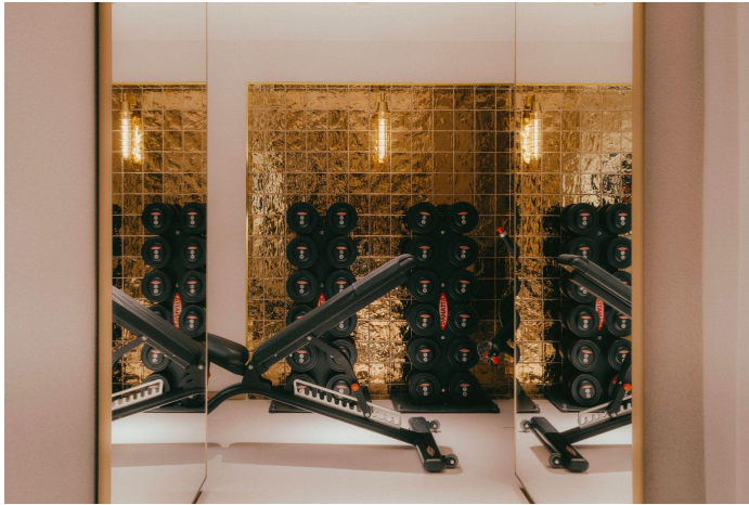
Performance-level fitness meets holistic recovery. The gym at Brach Madrid's La Capsule offers a state-of-the-art sanctuary for mind and body.

Inspirational destinations & properties of excellence