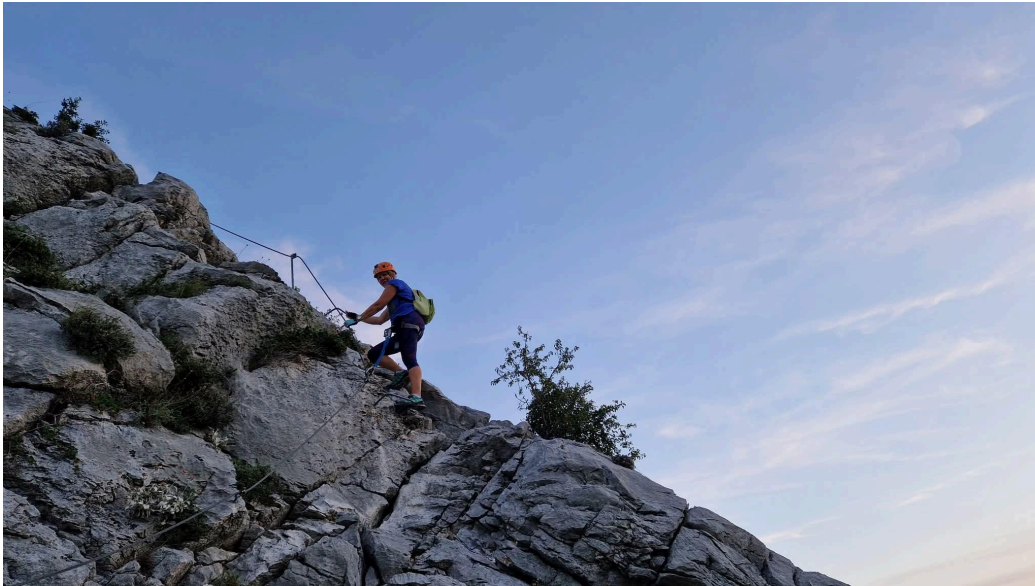
Tackling the spectacular Via Ferrata route above Omiš—an exhilarating combination of sport, history, and scenery, rising high above the Adriatic coast.

Inspirational destinations & properties of excellence