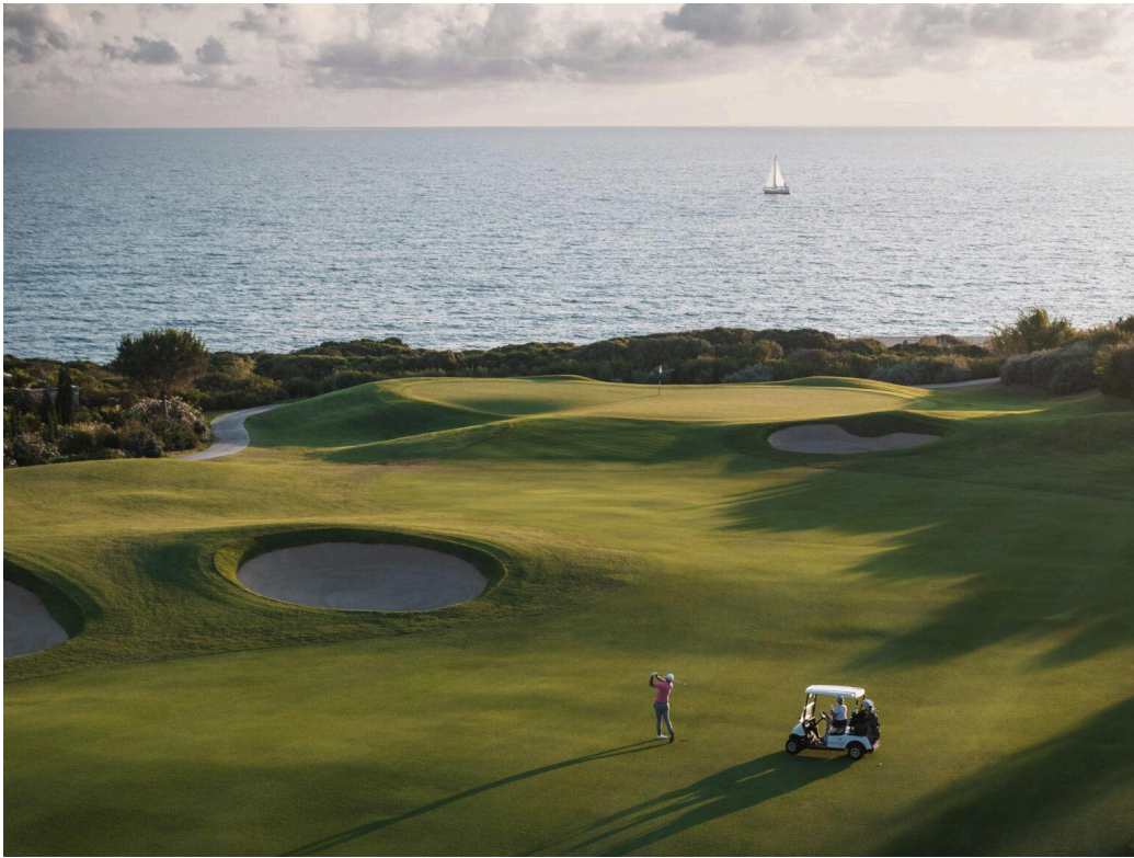
A perfect lie at Costa Navarino, where every shot comes with a stunning Ionian Sea backdrop.