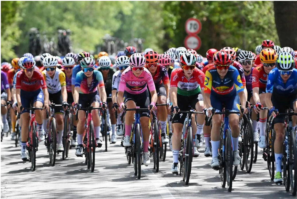
Blending world-class sport with Israel's rich heritage and natural beauty: Elite cycling events along the Mediterranean coast transform the country into a dynamic global stage.