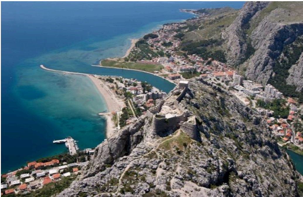
Historic Omiš and the Adriatic, as seen from above, a truly magnificent, unforgettable view.

Sports and major events have a unique way of bringing destinations to life, creating memorable travel moments that blend excitement, culture, and spectacular landscapes. In Croatia, active experiences are increasingly becoming part of sophisticated journeys that blend adventure with natural beauty and heritage.