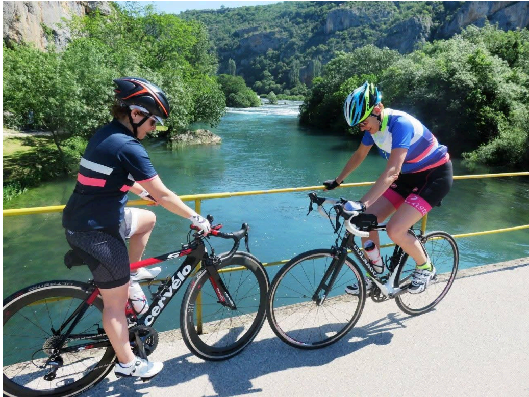
Cycling through Croatia's hidden gems. A tranquil pause on a sun-drenched bridge, where the beautiful river below offers the ultimate reward.

Inspirational destinations & properties of excellence