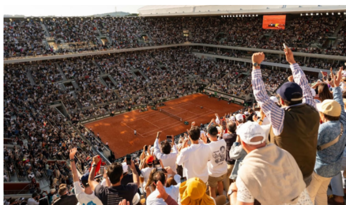
The legendary red clay courts of Roland-Garros, where the roar of the crowd adds to the intensity of every rally.

As spring turns toward summer, the atmosphere intensifies across the country. The legendary red clay courts of Roland-Garros (May 18 - June 7, 2026) welcome the world's greatest tennis players, while farther west, the iconic 24 Hours of Le Mans (June 10 - 14, 2026) captivates motorsport enthusiasts with its unique blend of endurance and heritage.