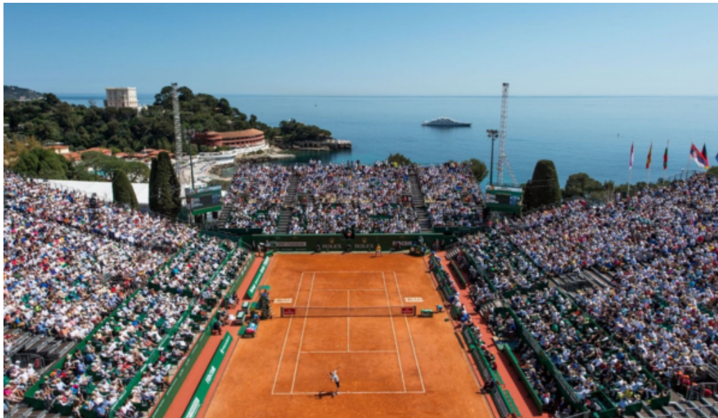
Courtside glamour at the Rolex Monte-Carlo Masters, where the world's best compete in one of tennis's most beautiful settings.

Inspirational destinations & properties of excellence