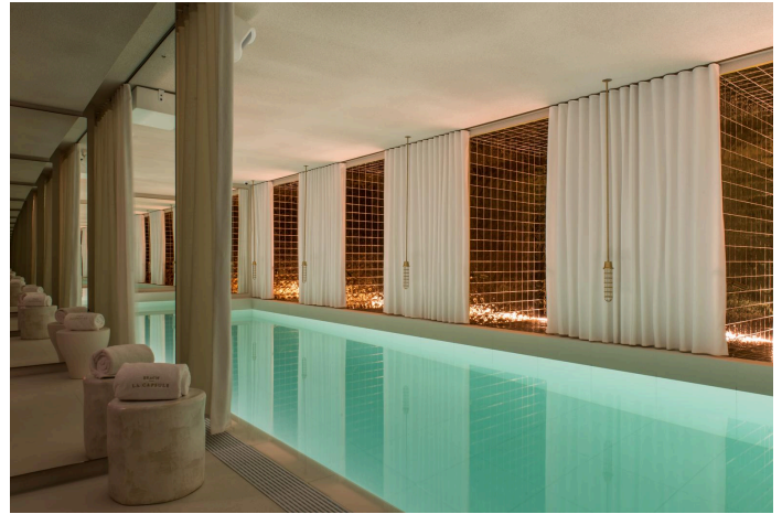
Design and tranquility converge. Find the flow in the striking indoor pool at Brach Madrid's exclusive La Capsule wellness area.