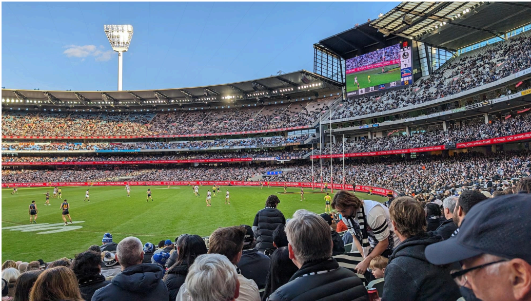
The roar of the crowd, the local legend escort, and the heart of Melbourne. Experiencing the electric passion of AFL with a true local is a cultural immersion.

These sports-loving nations are also an adventure playground for those who would rather participate than spectate—everything from golfing on championship courses to catching trophy-worthy trout (Barramundi or Black Marlin), skiing, surfing, sailing, running sightseeing tour routes or through local park, day cycling (stopping to sample local wines), and multi-day cycling trips.