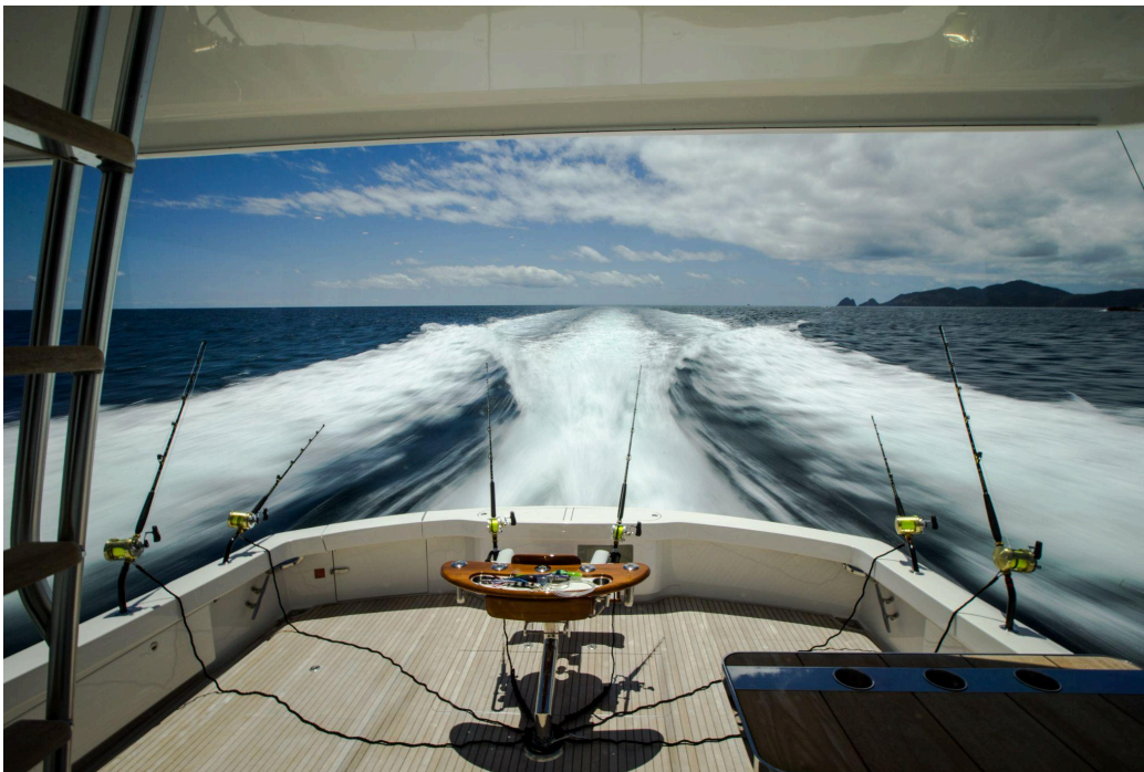
High-speed pursuit on the open water: The Ata Rangi cuts through the waves, a blur of motion and focus as the crew chases the perfect catch.