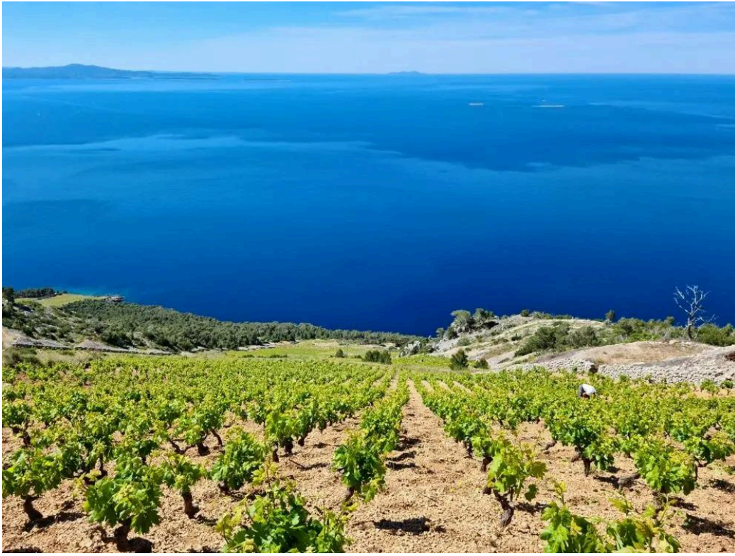
Sun-drenched drama: The famously steep, south-facing slopes of Hvar, where the Plavac Mali grape thrives, overlooking the Adriatic Sea near Sveta Nedjelja.

Inspirational destinations & properties of excellence