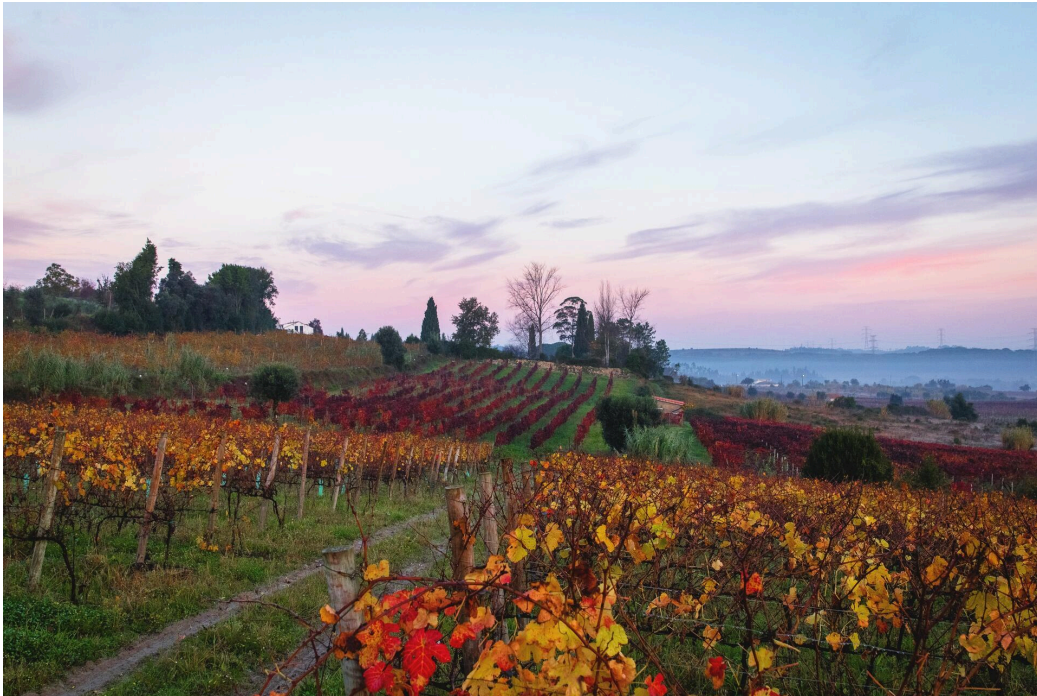
The Bairrada Baga vines, ablaze in the colors of a Portuguese autumn. A perfect vintage view.

Inspirational destinations & properties of excellence