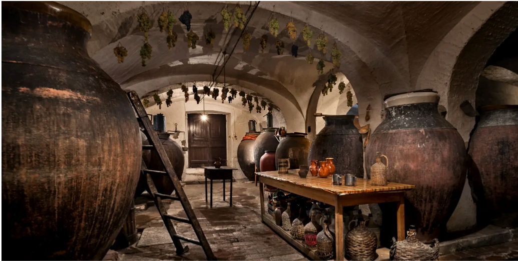
Alentejo's liquid gold, aged to perfection: Inside a classic Portuguese wine cellar, a tribute to the region's winemaking heritage.

Inspirational destinations & properties of excellence