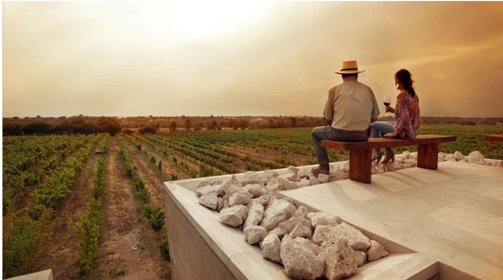
Uncorking romance in the vineyards of San Miguel de Allende.

Inspirational destinations & properties of excellence