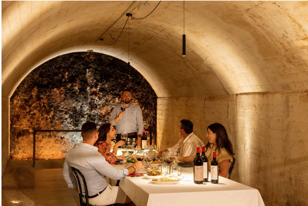
Taste the legacy. Going behind the scenes for a private vintage tasting in the rarefied atmosphere of the Penfolds Magill underground.

Inspirational destinations & properties of excellence