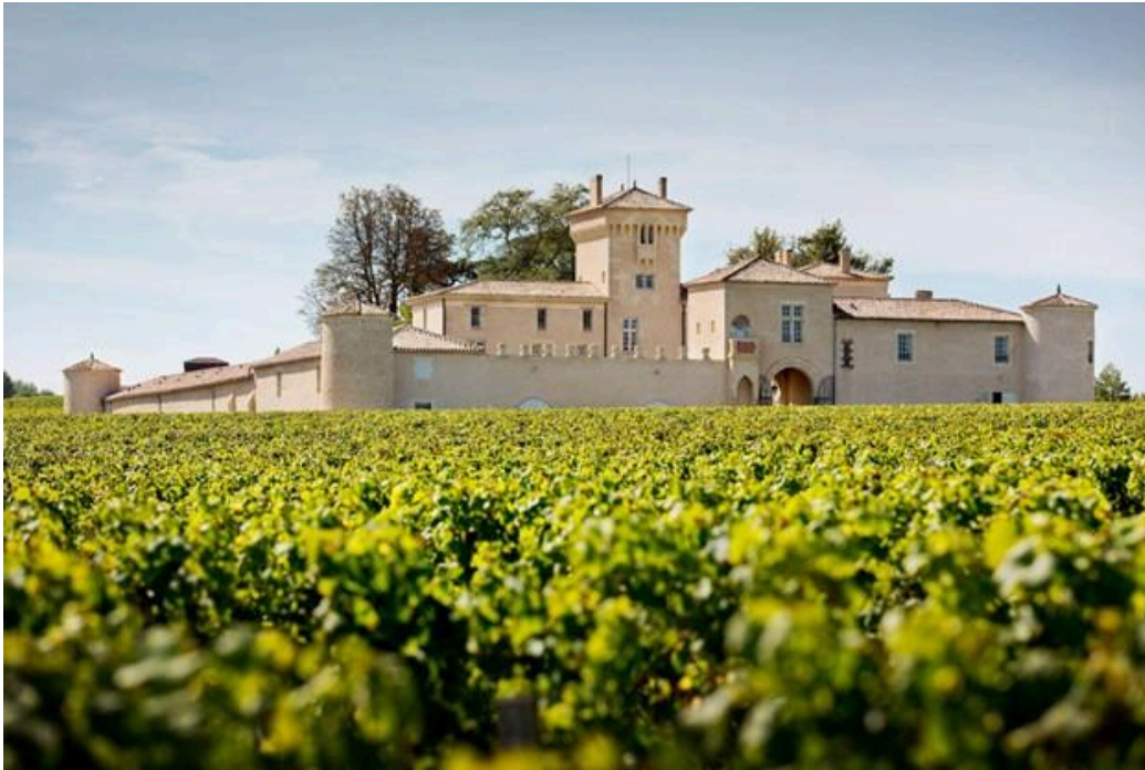
The taste of Bordeaux, rooted in history. Witnessing the Grand Cru Classé vineyards of Château de Pressac.

Inspirational destinations & properties of excellence