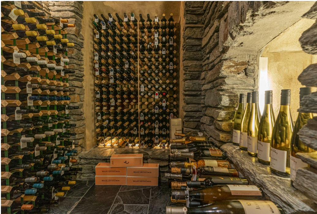
The secluded Wine Cave at Blanket Bay: an intimate space for private dinners and bespoke wine tastings, central to New Zealand's celebrated Central Otago wine program.