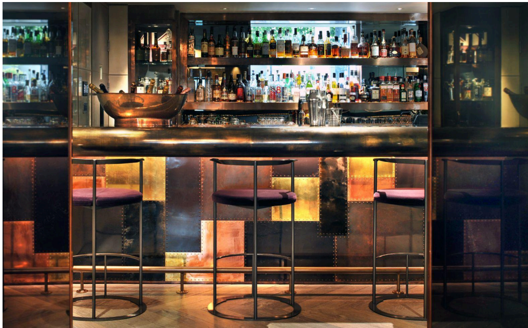
London, illuminated: The perfect vintage and even better company at The Hari's Bar, where sophistication meets comfort.

Inspirational destinations & properties of excellence