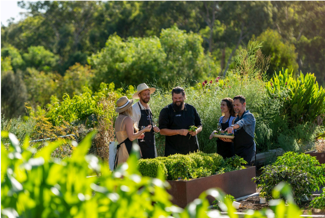
From garden to glass - forage, savor, and indulge in a winemaker-hosted lunch that celebrates the fresh, seasonal flavors of the Barossa Valley.

Inspirational destinations & properties of excellence