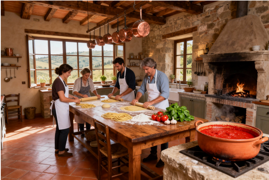
The authentic flavors of Tuscany: Hands-on pasta, Chianti, and villa life in a cooking class with Vakay.

Inspirational destinations & properties of excellence