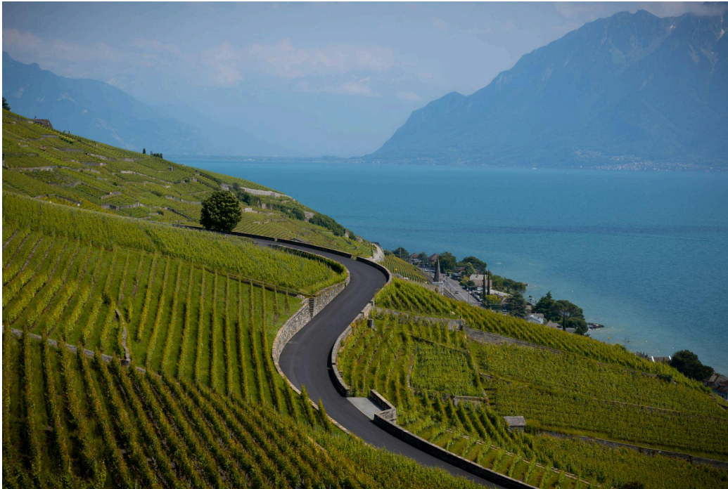
A Swiss spectacle: Precision-tended Lavaux vineyards climb the slopes above the serene blue of Lake Geneva, a UNESCO-listed landscape of wine and wonder.

Inspirational destinations & properties of excellence