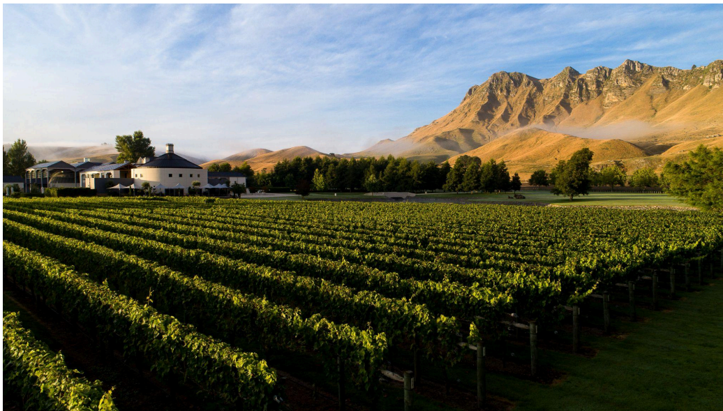
A view worthy of its name. Discover the majestic Craggy Range Giants Winery, set against the stunning backdrop of Hawke's Bay.

Again, those looking to sleep among the vines will soon have a new option in New Zealand's South Island, too. On the eastern slopes of the South Island's main divide, in one of New Zealand's largely unsung wine regions, The Lindis Group (the team behind the Lindis, Mt. Isthmus, and Paroa Bay) is preparing to unveil a new accommodation offering on their Clos Ostler vineyard estate in the Waitaki Valley. Clos Ostler's Pinot Noirs have collected consecutive Gold awards at the London International Wine Challenge, making this one a one-to-watch for serious wine lovers.