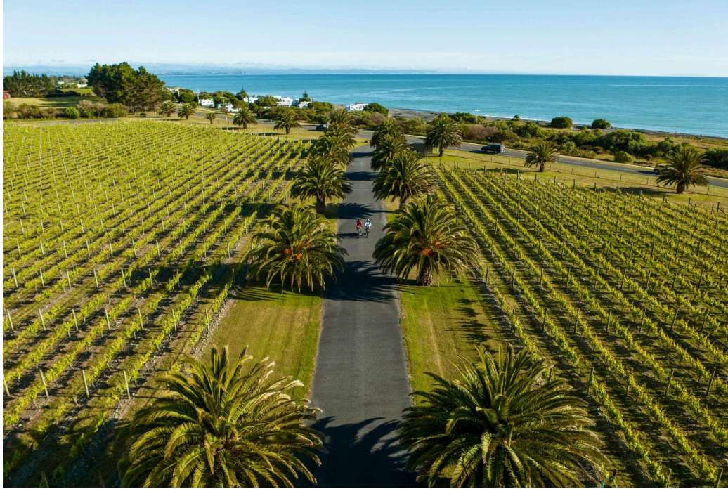
The ribbon of rows: A bird's-eye view of a Hawke's Bay vineyard, home to New Zealand's celebrated Chardonnays and Cabernet Sauvignons.

winemaking masterclasses and truffle hunts (in season), private meals among the vines, and introductions to local makers and artisans.