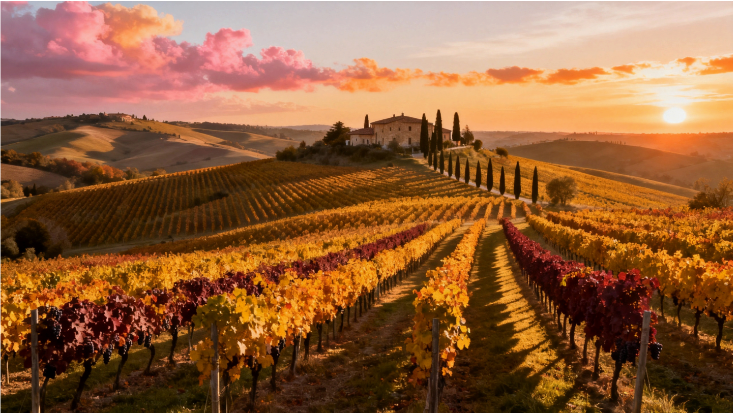
Golden hour in Chianti: Autumn's fiery kiss over the meticulously tended vineyards of Tuscany.

Inspirational destinations & properties of excellence