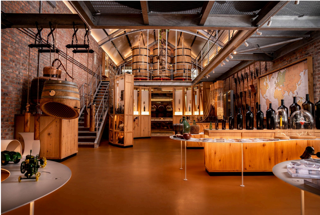
Human ingenuity, earth's generosity. Discover the story of wine at Babylonstoren.

Inspirational destinations & properties of excellence