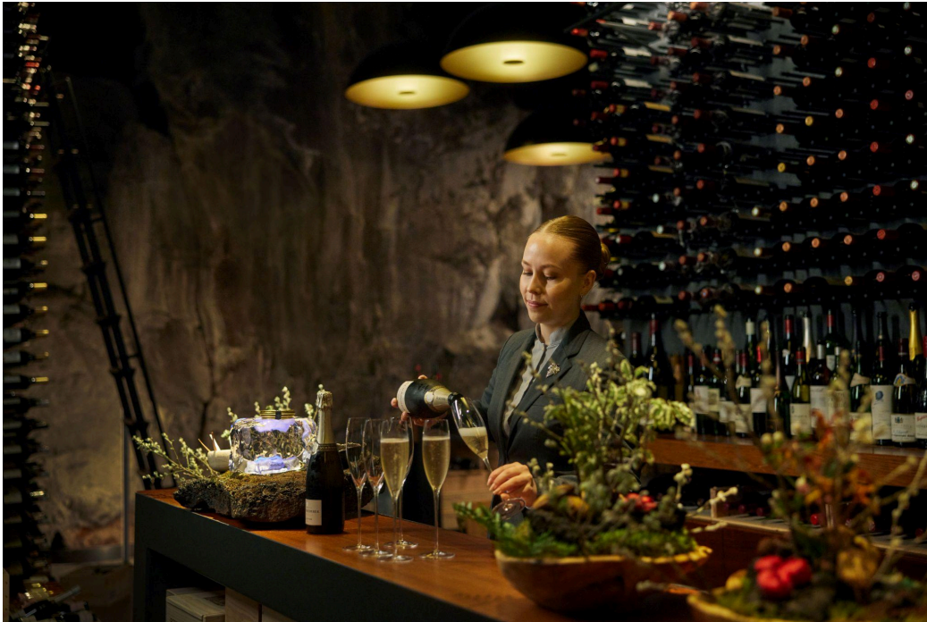
Bubbles and beauty: celebrating with champagne in the heart of Iceland.

Inspirational destinations & properties of excellence