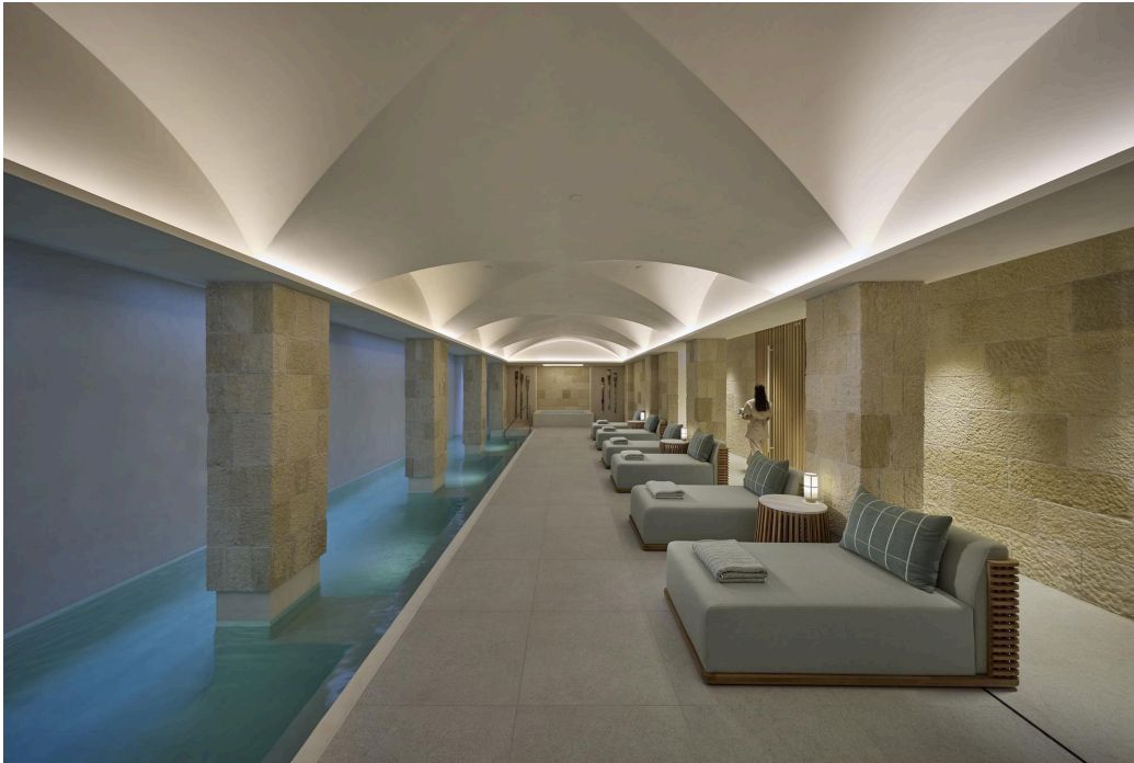
The purest form of restoration. Experience the ROKI Pure Pool as part of your tailored wellness 'rituals, resets, and rewilds' in Queenstown.

Inspirational destinations & properties of excellence