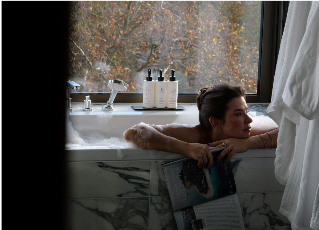
Finding inner calm and a vibrant view. The perfect autumn escape in the heart of Belgravia.

Inspirational destinations & properties of excellence