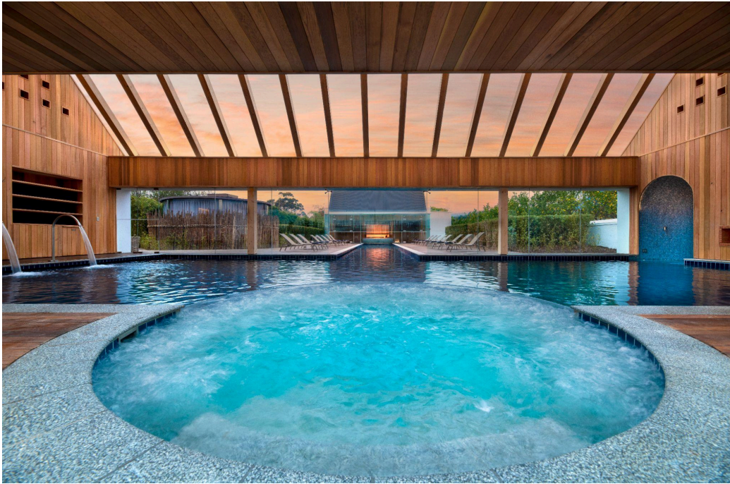
Wellness is in the atmosphere. Let the state-of-the-art Vitality Pool melt away the outside world.

Inspirational destinations & properties of excellence