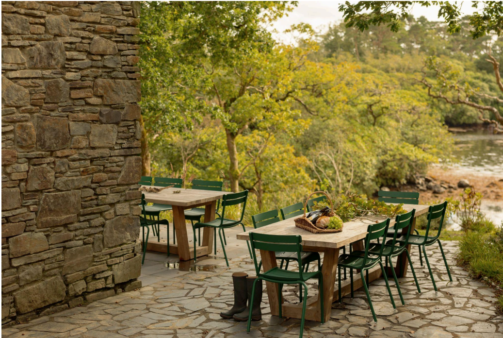
Unplug, breathe, and connect. A perfect scene of stillness in the stunning Dromgarriff Rainforest.

Inspirational destinations & properties of excellence