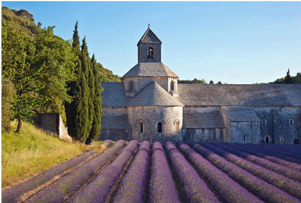
Finding a quieter rhythm amidst the lavender.

Inspirational destinations & properties of excellence