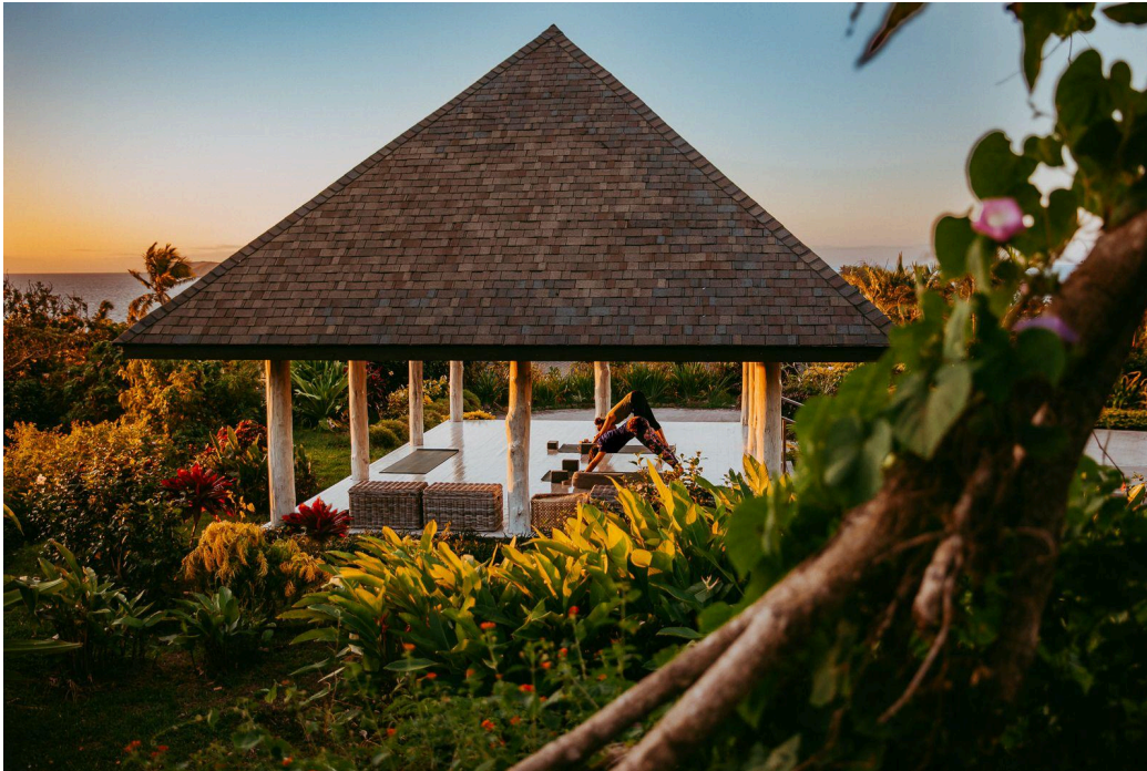
Finding true stillness where Fiji's warm breezes meet the horizon. A moment of deep restoration at Kokomo Private Island, curated by Southern Crossings.

Inspirational destinations & properties of excellence