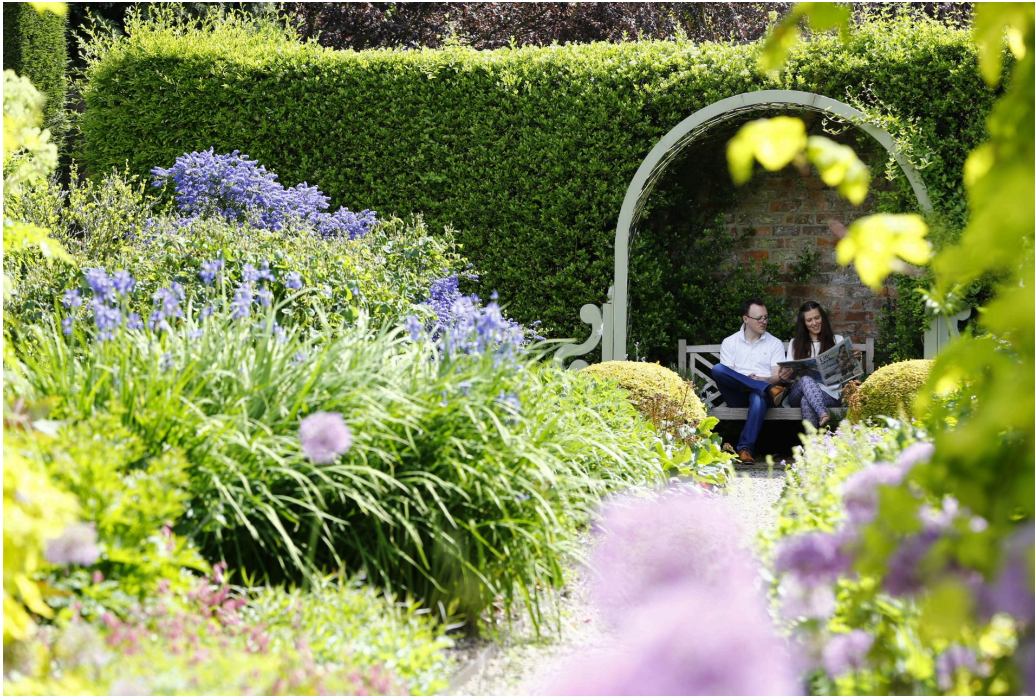
Walled garden whispers and a peaceful read for two.

Inspirational destinations & properties of excellence