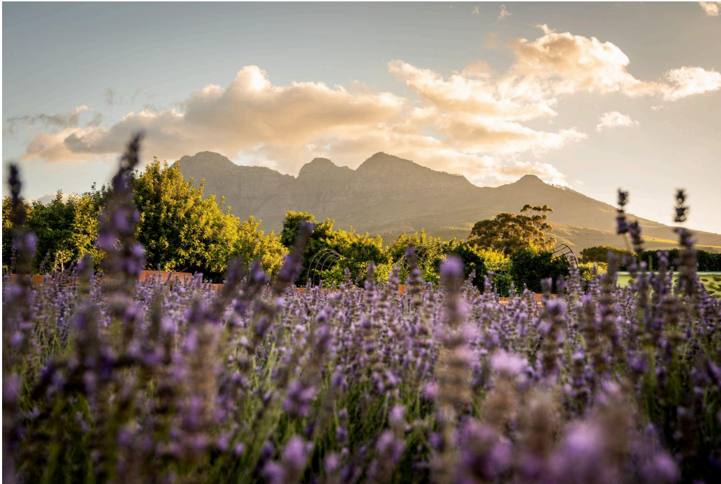
The fragrant heart of the Cape Winelands. Babylonstoren's lavender in full, glorious bloom.

Inspirational destinations & properties of excellence