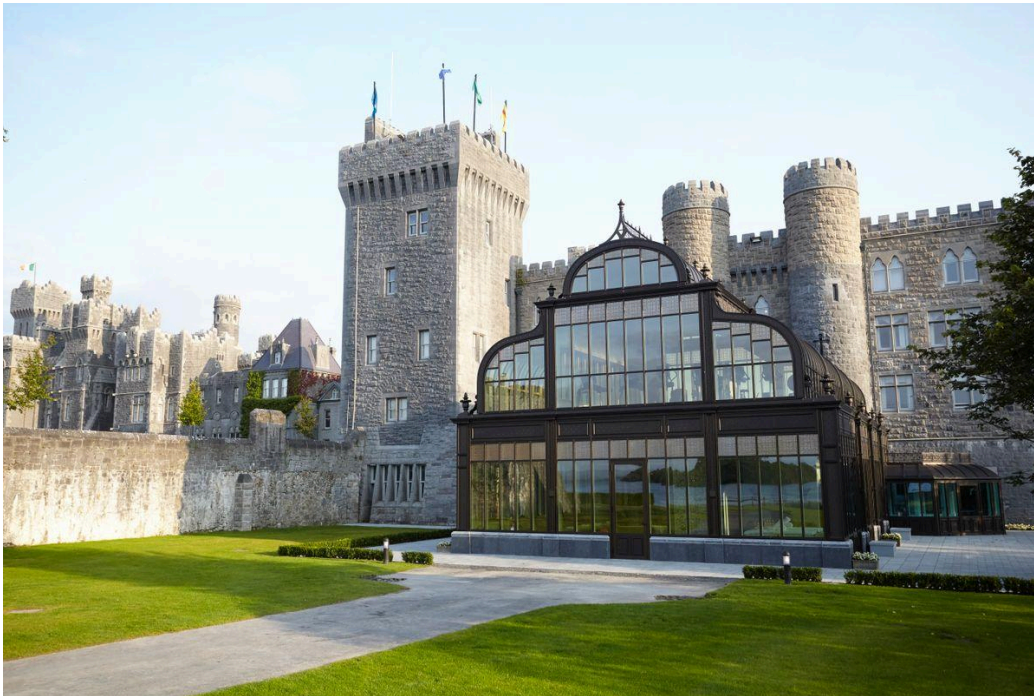
A sanctuary carved from nature: The glass spa at Ashford Castle, where tranquility and ancient Irish heritage meet for a journey of deep restoration.