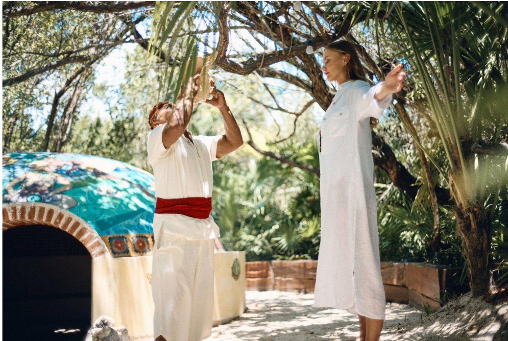
Enter the Temazcal: a journey of purification and rebirth, guided by ancient Mayan wisdom.

Inspirational destinations & properties of excellence