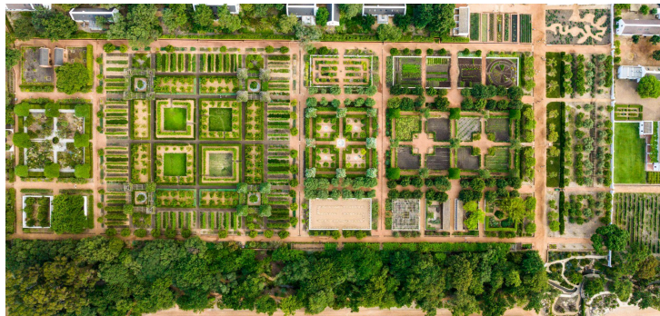
Where every path is an invitation to slow down and reconnect. Discovering the quiet wonders of Babylonstoren.

On the farm, wellness extends far beyond traditional spa offerings. Movement, rest, and nourishment are thoughtfully balanced through experiences that allow guests to slow down and reconnect. Stretch and Breathe sessions, guided by expert instructors, take place in the serene yoga studio, on the lawn beneath ancient oaks, or in the soft, dappled light of the Clivia House. Each setting invites a quieter rhythm and restores both body and mind.