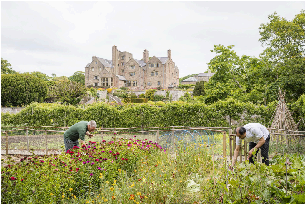
Wellness rooted in the land. The chef's daily harvest from Bodysgallen Hall's gardens embodies nourishment as the truest form of restoration, going beyond the spa.

Inspirational destinations & properties of excellence