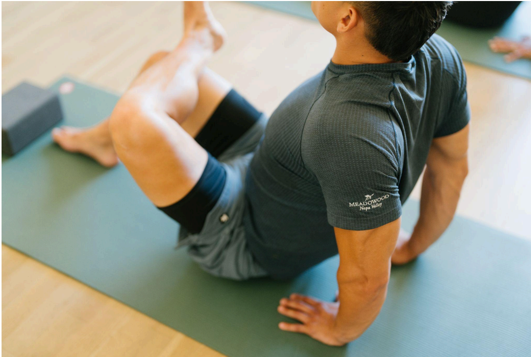
Whole-body restoration in wine country. Starting the day right with Stretch and Tone at Meadowood Napa Valley.

Inspirational destinations & properties of excellence