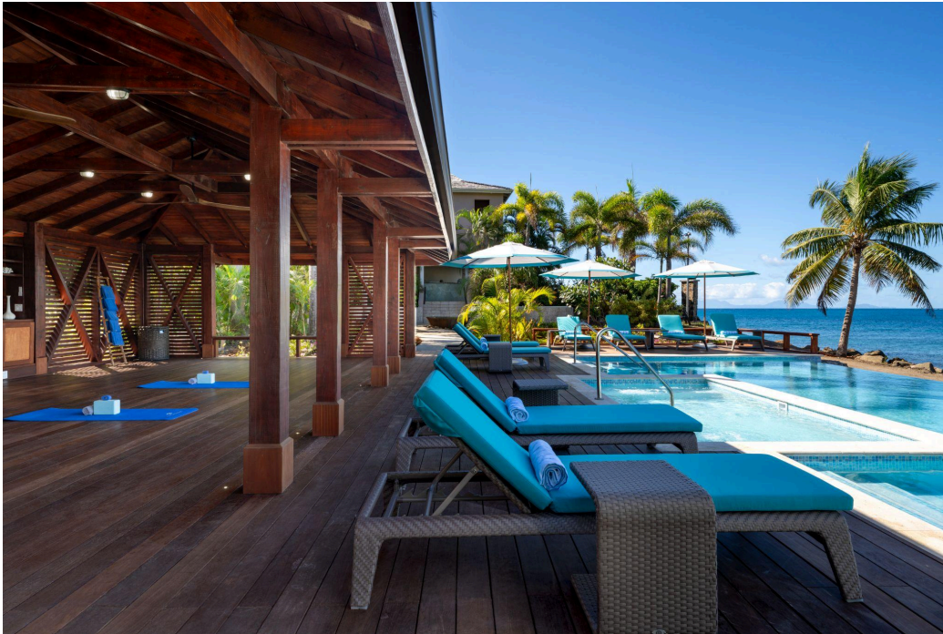
A space for intentional movement and deep restoration in the yoga deck and tranquil adult pool area.

Inspirational destinations & properties of excellence