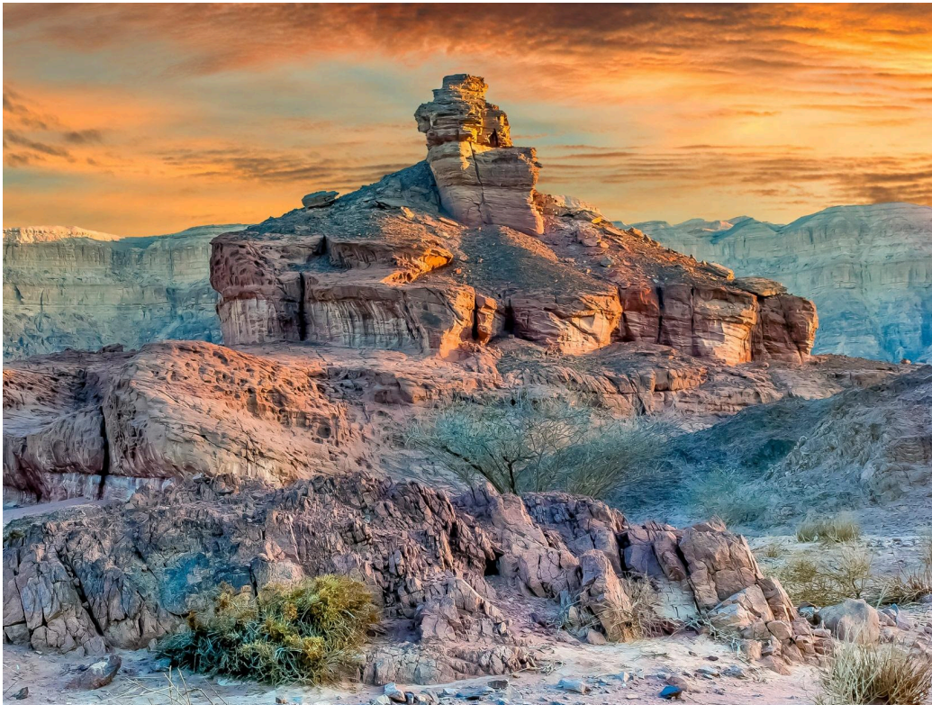
A geological masterpiece. The striking, multi-colored rock formations of Timna Park are a breathtaking display of nature's artistry in the Negev desert.

International air service to Tel Aviv has largely resumed, offering travelers more flexibility. Flights are currently available through United Airlines, Delta Air Lines, British Airways, Air Canada, El Al, Air France, Lufthansa, ITA Airways, and Etihad. Additional carriers are continuing to evaluate future schedules. Increasing connectivity means smoother arrivals, easier connections, and a stress-free start to your clients' journeys.