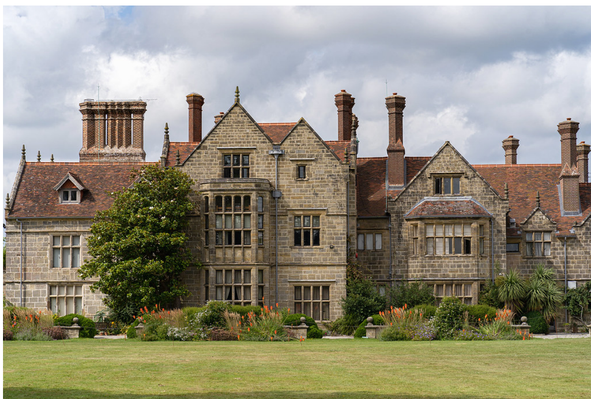
Borde Hill.

Grade II-listed Elizabethan Mansion House, is just 15 minutes away in 383 acres of an Area of Outstanding Natural Beauty on the High Weald. Other nearby botanical beauties include Wakehurst Place, High Beeches Gardens, and Sheffield Park.