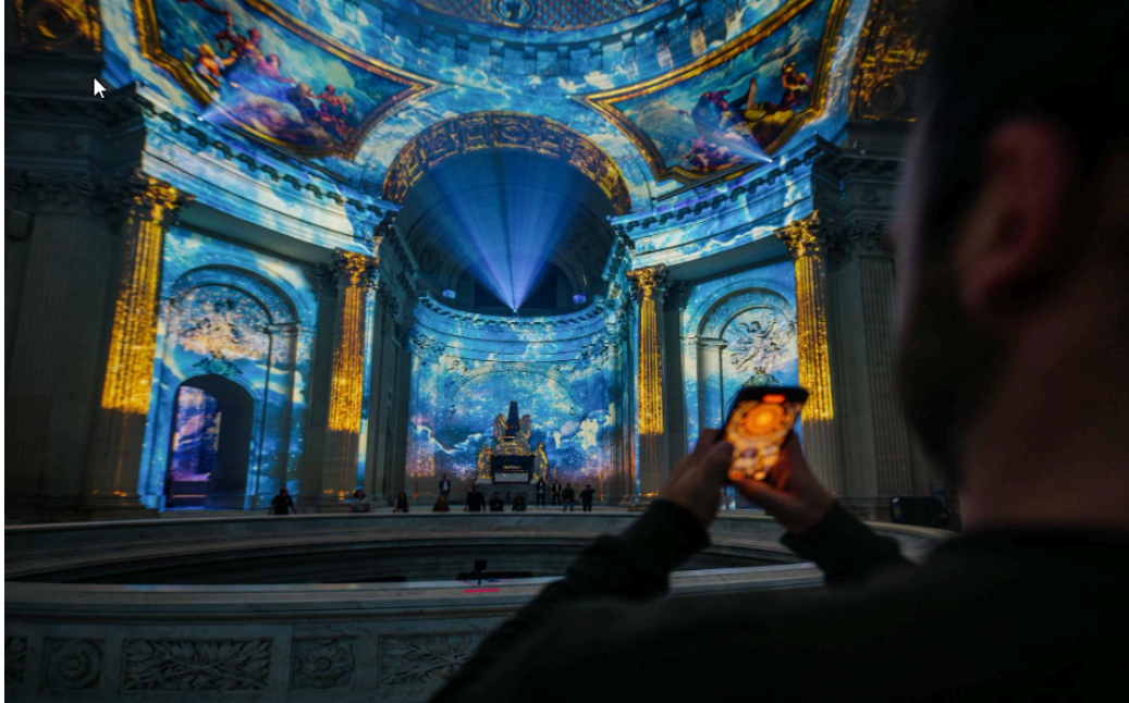
A dazzling sound and light show at a historic Parisian Church.