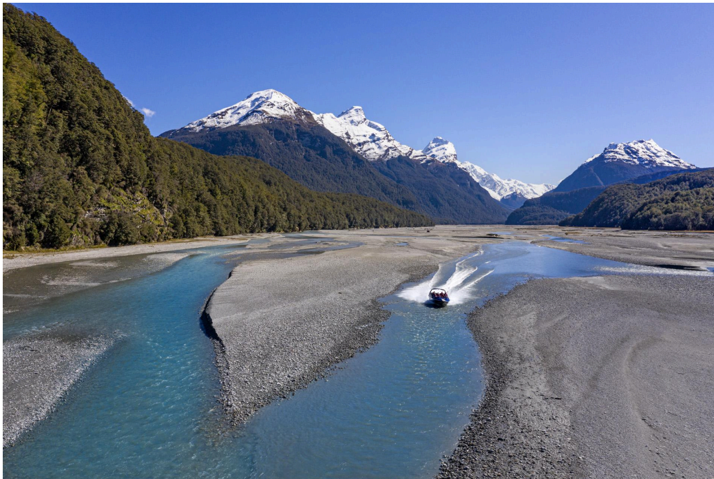
Enjoy Dart River Jet boating while at Blanket Bay.

From the ocean to the outback, Lizard Island to Longitude 131 , most of Australia's luxury lodges warmly welcome children (from 10 years of age), some even providing dedicated family-friendly activities, including beach games, crafts, kites, and children's bikes. The Southern Crossings team also has access to some fabulous family-friendly private villas, beach houses, and exclusive-use islands—ideal for a multigenerational family celebration with space for everyone to come together, and space for everyone to call their own—the newest example: Pelorus Private Island on Australia's Great Barrier Reef (opened in December 2023) is an exclusive-use serviced island that welcomes families of all ages.