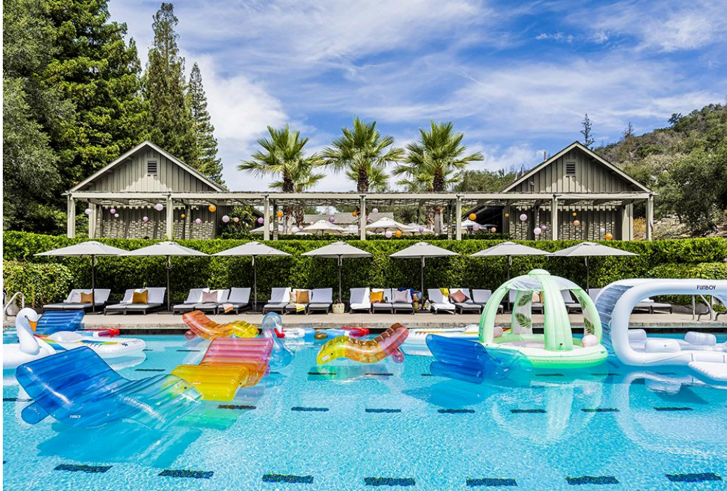
A fun-filled splash party in the Fitness Pool at Meadowood Napa Valley.