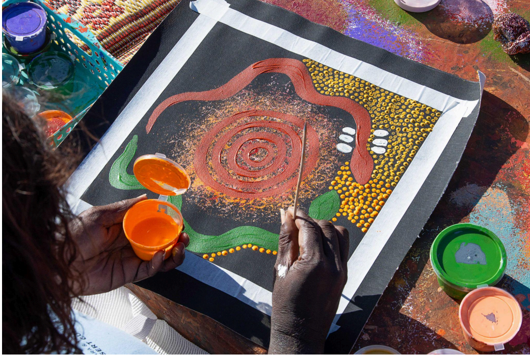
Uluru Aboriginal Dot Painting.