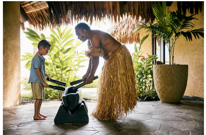
Como Laual Kids Cultural Lali