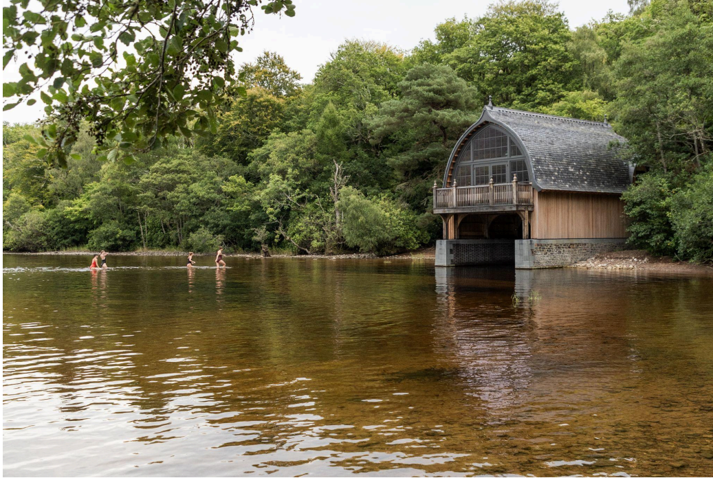
The Boat House at Aldourie Castle.