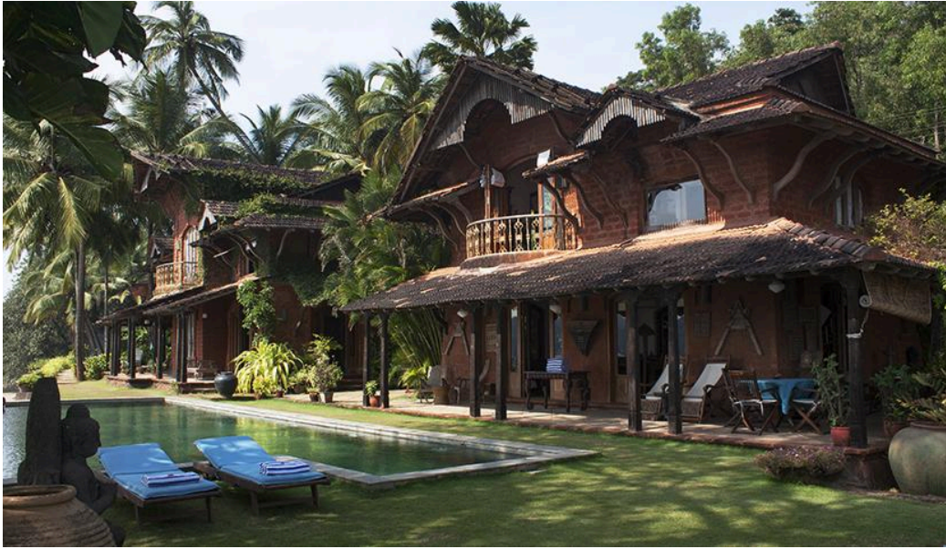
Ahilya by the Sea - Goa.

Inspirational destinations & properties of excellence