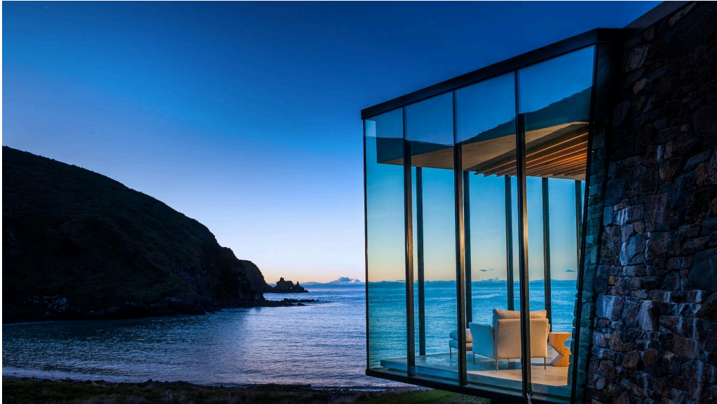
Annandale Seascape is a self-contained contemporary luxury villa for two on a picturesque private bay.

Inspirational destinations & properties of excellence