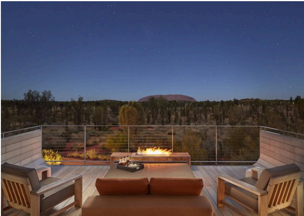
Enjoy a romantic evening with endless views across the Outback's rugged red earth at Longitude 131.

Holistically focused on relaxation and wellness, this three-suite romantic retreat on the edge of Abel Tasman National Park delivers all the ingredients of a relaxing romantic retreat: coastal walks and tailored dining, kayaking to a secluded bay or relaxing with a soothing massage. From heli-picnicking to horseback riding on the beach, the choice is entirely up to your clients.