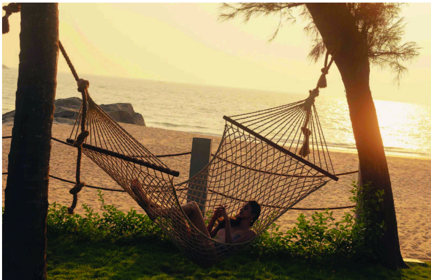
Postcard on the Arabian Sea - Karnataka.

This private escape by Dolphine Bay is pure paradise. Sink into understated elegance in this cozy haven, spread over three independent villas. Highlights include a sunrise infinity pool, surrounded by pink and white frangipani, and delectable cuisine enjoyed al fresco under the sky.