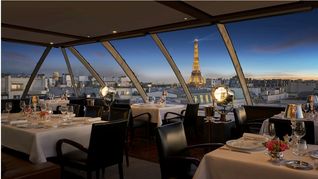
Enjoy a scrumptious and romantic dinner for two at Table Secrète - Peninsula.

Inspirational destinations & properties of excellence