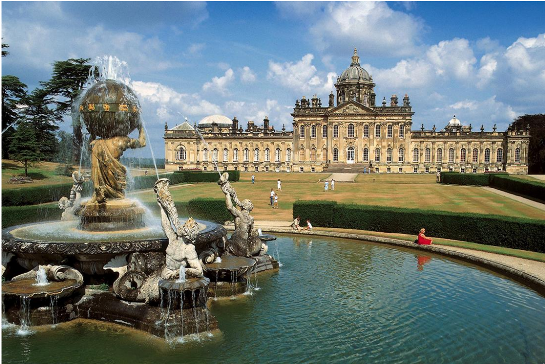
Castle Howard in Yorkshire, an easy visit when staying at Middlethorpe Hall and Spa.

Inspirational destinations & properties of excellence