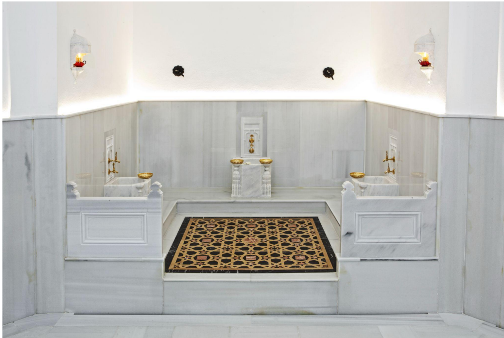
Relax and refresh at Hamam Bölümler.

Inspirational destinations & properties of excellence