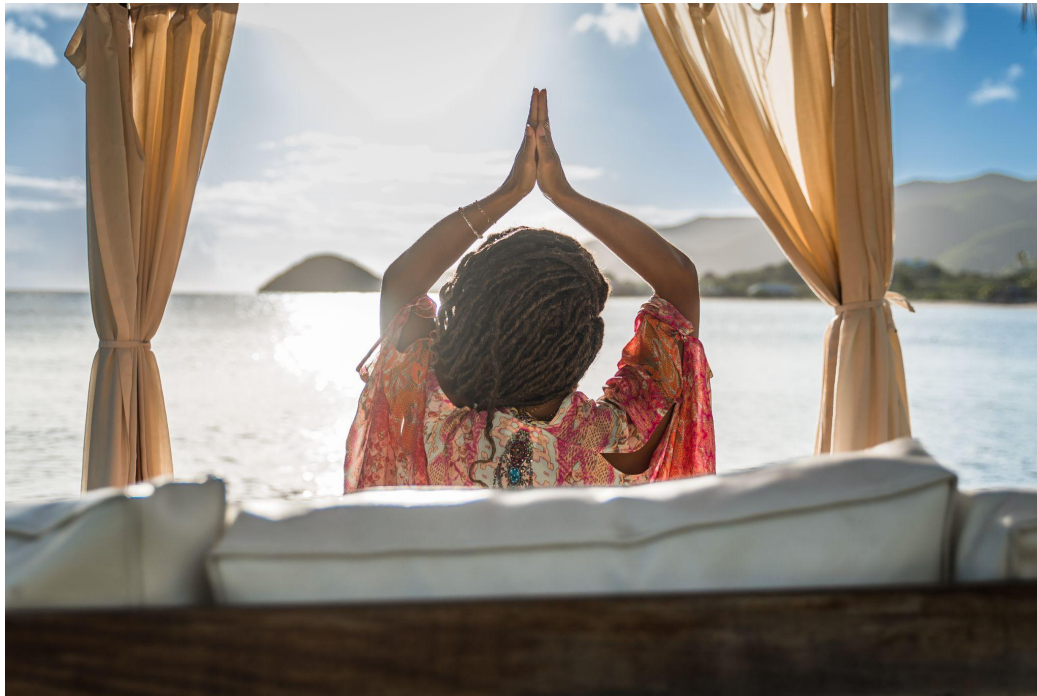
Health and wellness-focused weeks in Caribbean luxury.

Inspirational destinations & properties of excellence