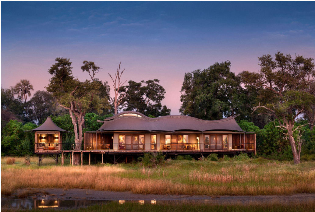
The Spa at Xigera Safari Lodge with its magnificent surrounding wildlife is one of a kind.

Inspirational destinations & properties of excellence