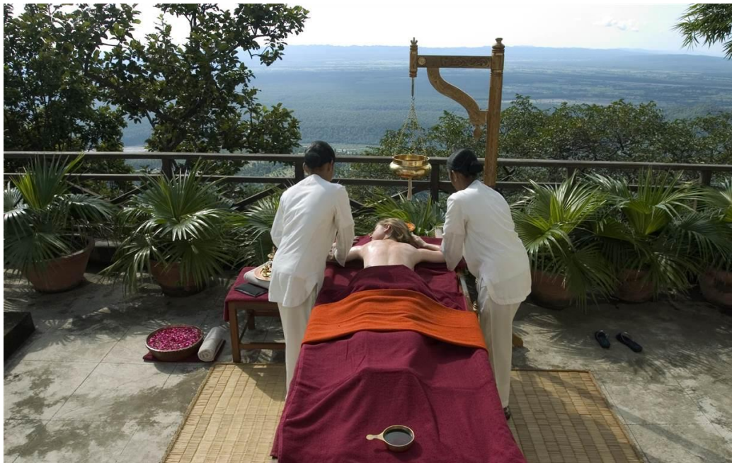
Experience healing of the mind and body with the backdrop of the Himalayas.

Inspirational destinations & properties of excellence