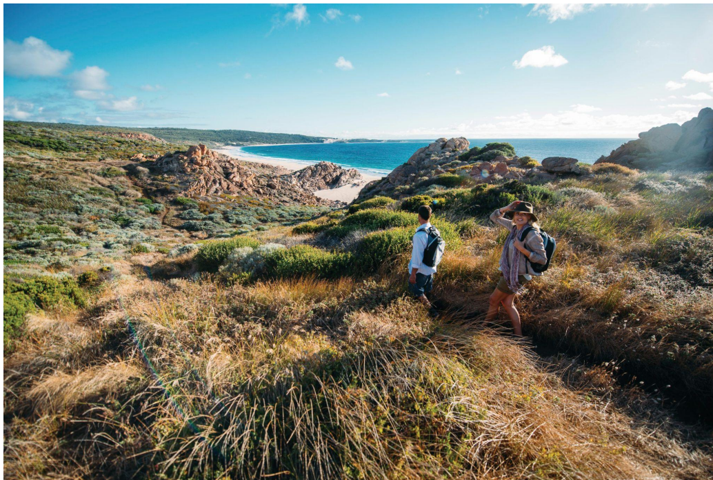
Cape to Cape Walk into Luxury, Margaret River - Western Australia.

Inspirational destinations & properties of excellence