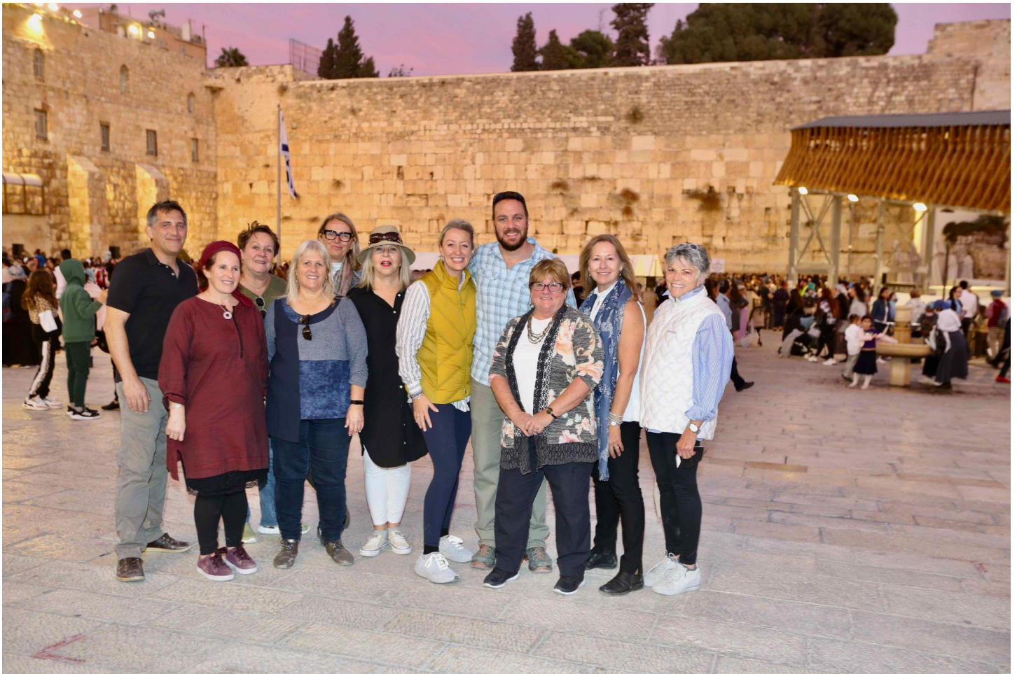
The ancient limestone Wailing Wall in the Old City of Jerusalem.

Now, read on ... and be in touch so that we may introduce you to our friends at TRAVEX for your own planning purposes.