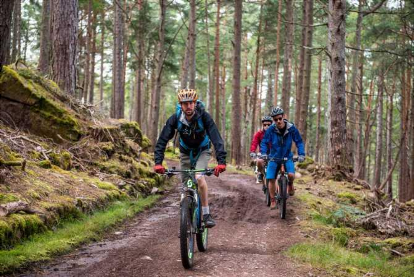
Mountain biking on the Ben Damph loop

Inspirational destinations & properties of excellence