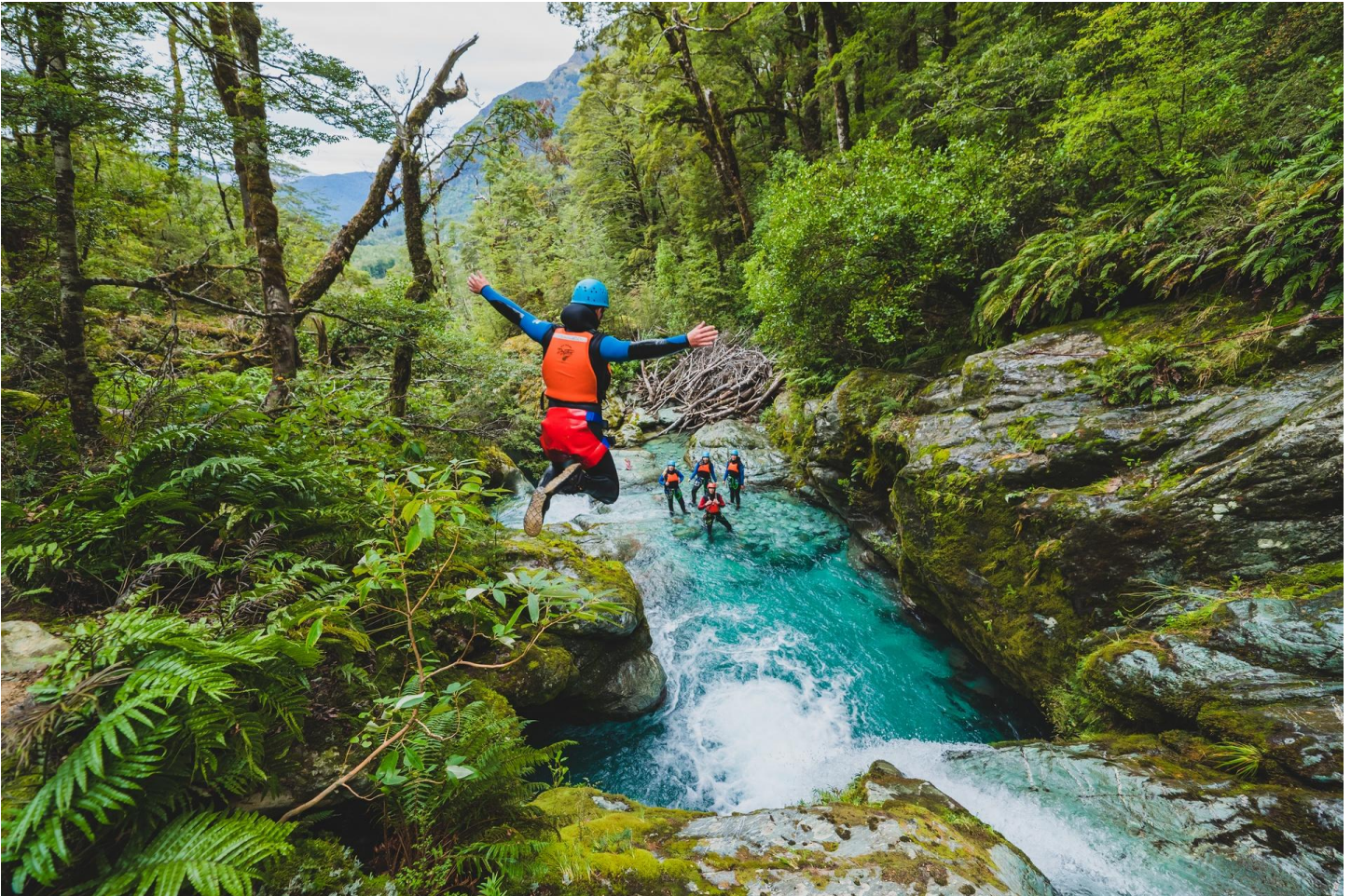
Adventure Canyoning.

Inspirational destinations & properties of excellence