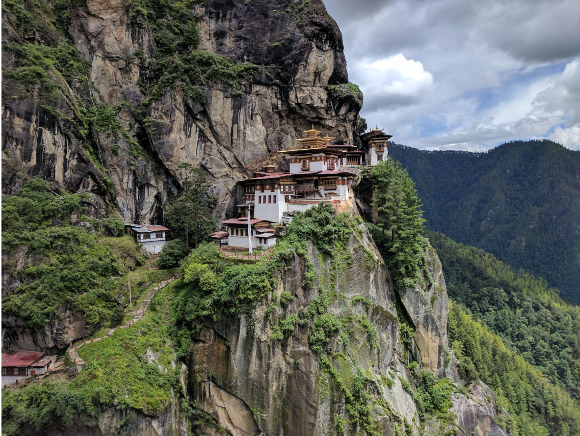
Tiger's Nest, Bhutan

Inspirational destinations & properties of excellence