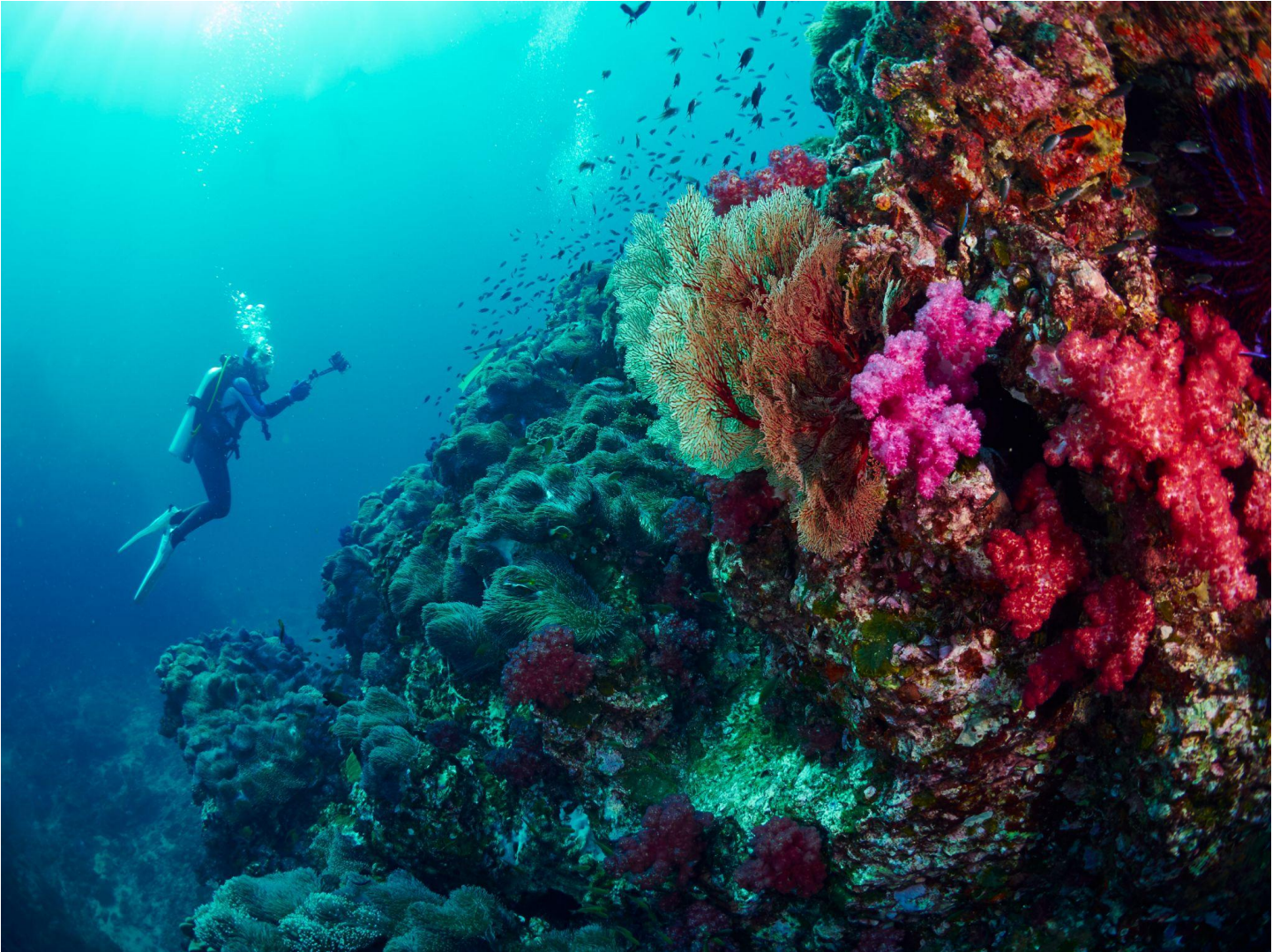
Snorkeling and diving under the Red Sea

Inspirational destinations & properties of excellence