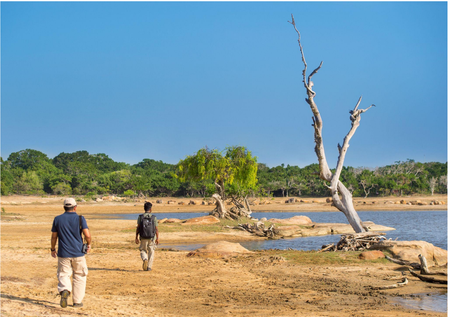
Expert rangers await you at Wild Coast Tented Lodge

Inspirational destinations & properties of excellence