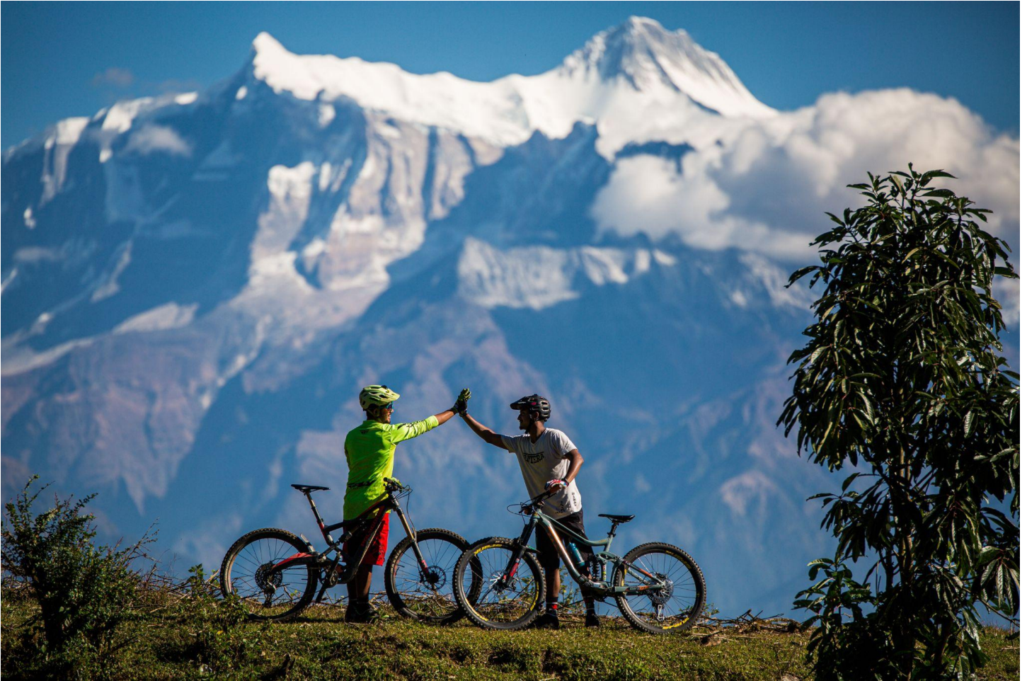
Experience mountain biking in Nepal.

Inspirational destinations & properties of excellence