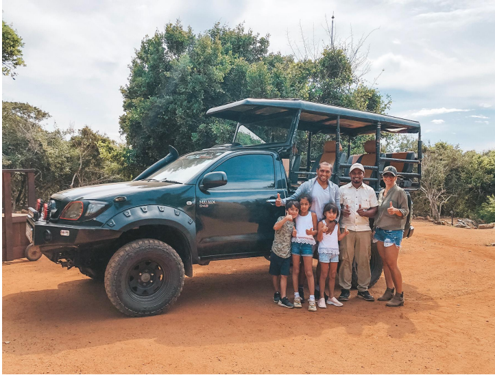
On safari in Sri Lanka while staying at Wild Coast Tented Lodge

Inspirational destinations & properties of excellence