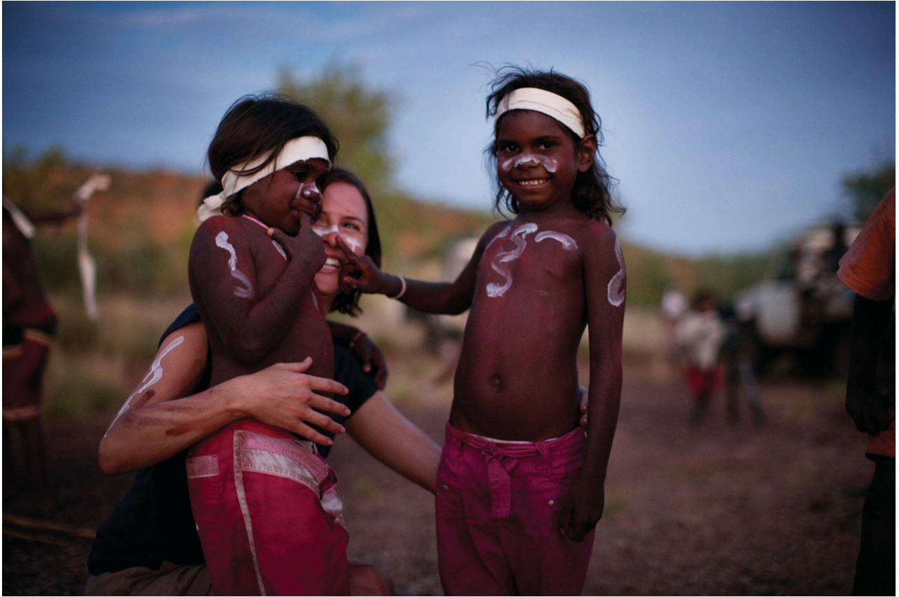
Indigenous experiences.

Inspirational destinations & properties of excellence