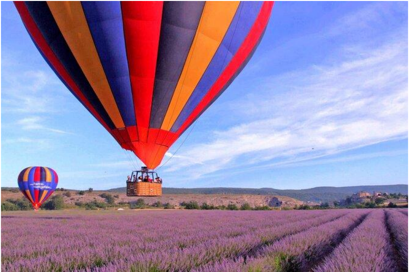
Ballooning over beautiful lavender fields in Provence

Inspirational destinations & properties of excellence