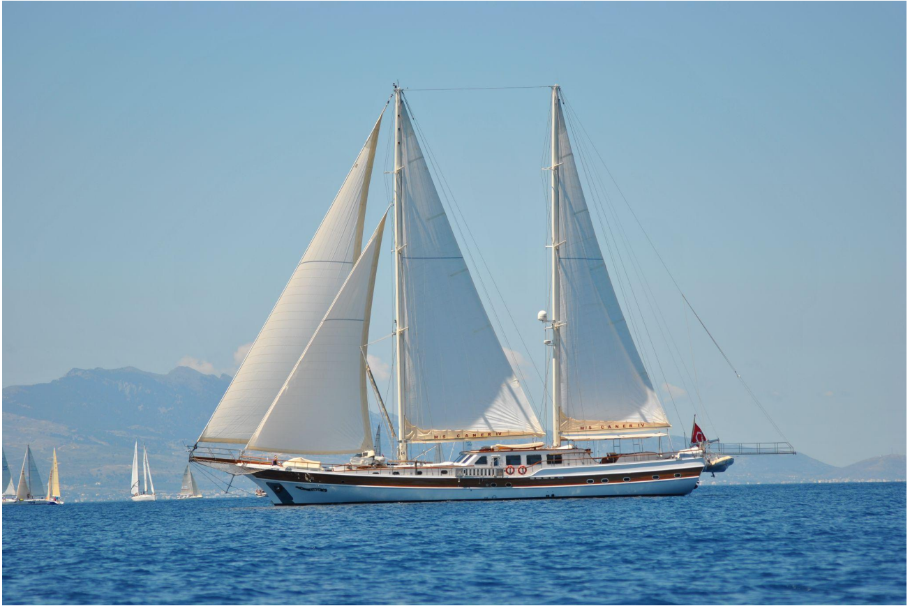
Gulet experiences in Bodrum

Inspirational destinations & properties of excellence