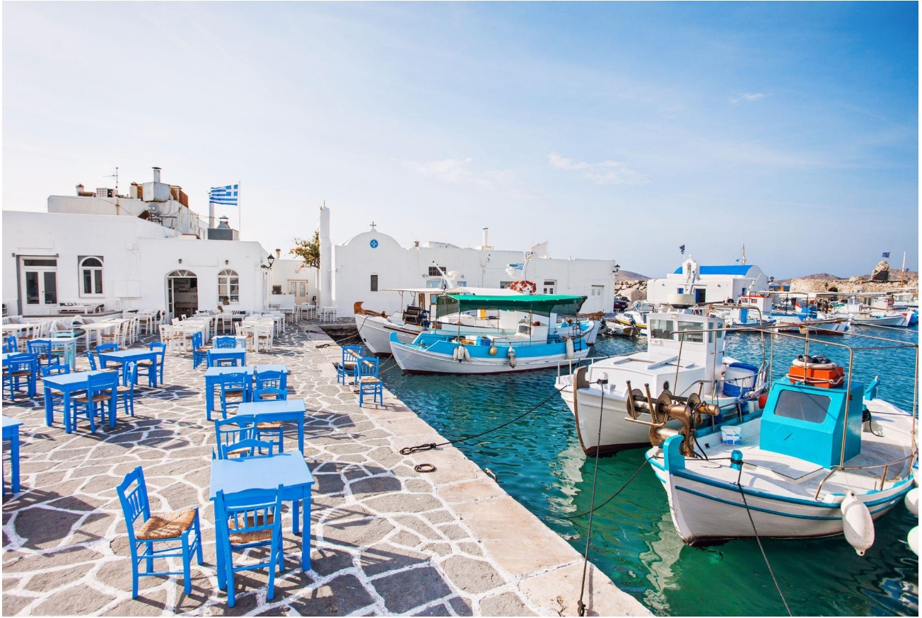
Explore one of the many islands in Greece

Inspirational destinations & properties of excellence