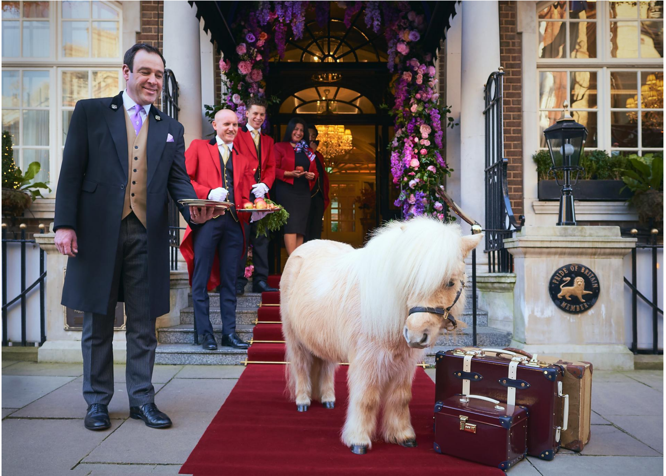
Teddy, the Shetland Pony

Inspirational destinations & properties of excellence