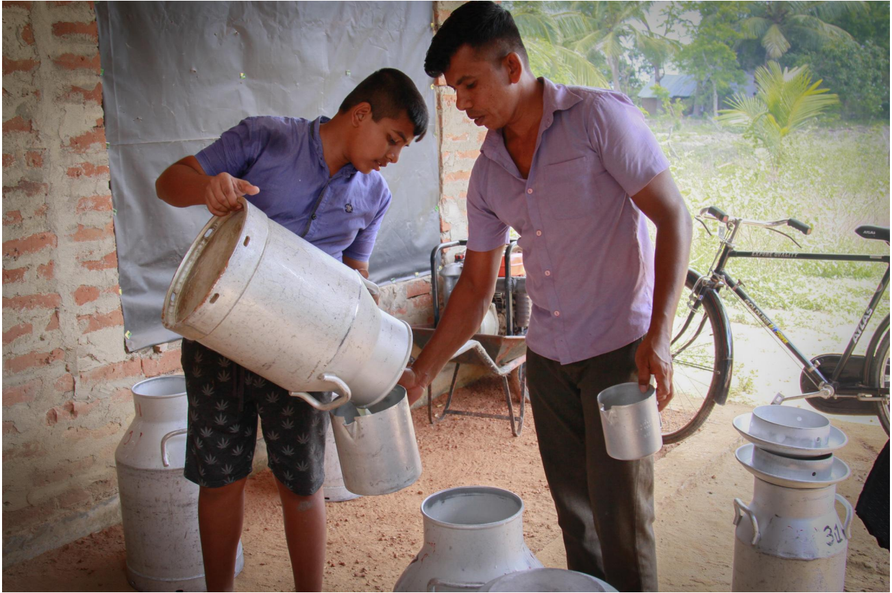
Learning about Buffalo milk collection in Sri Lanka

Inspirational destinations & properties of excellence