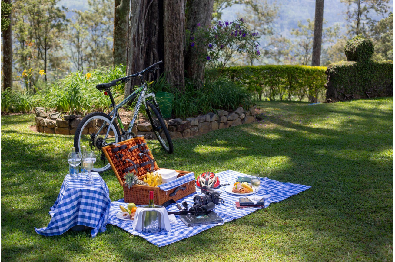
A perfect picnic lunch with idyllic views

Inspirational destinations & properties of excellence