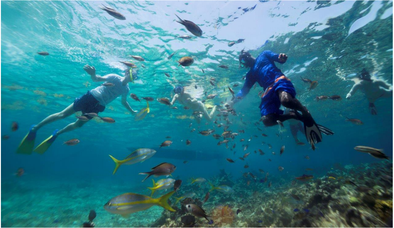
Enjoy snorkeling in the crystal clear waters at Curtain Bluff

Inspirational destinations & properties of excellence