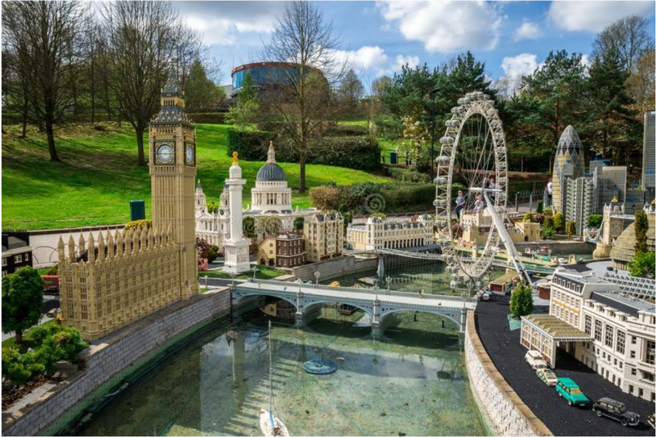
Legoland, moments away from Great Fosters

Inspirational destinations & properties of excellence