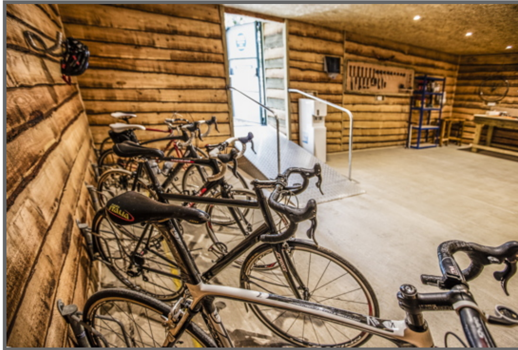
The new bike shed at Calcot.

Hartwell House has a remarkable history, stretching back almost a thousand years. Restorations in recent years include fireplaces, a dining room in the manner of Sir John Soane and a Gothic setting for the original features of the Staircase Hall. The gardens and park have also been extensively restored and some garden buildings and ornaments have been moved to their original positions.