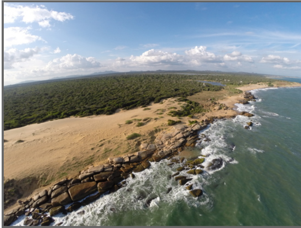
The site of Resplendent Ceylon's luxury camp in leopard country.