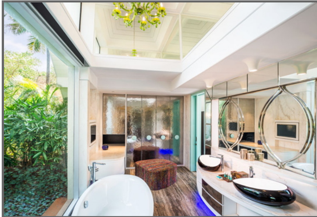
W Hotels' first hotel in India opens in Goa in October.

Once a hippie hangout, Vagatore Beach has become one of Goa's most exciting and vibrant destinations.