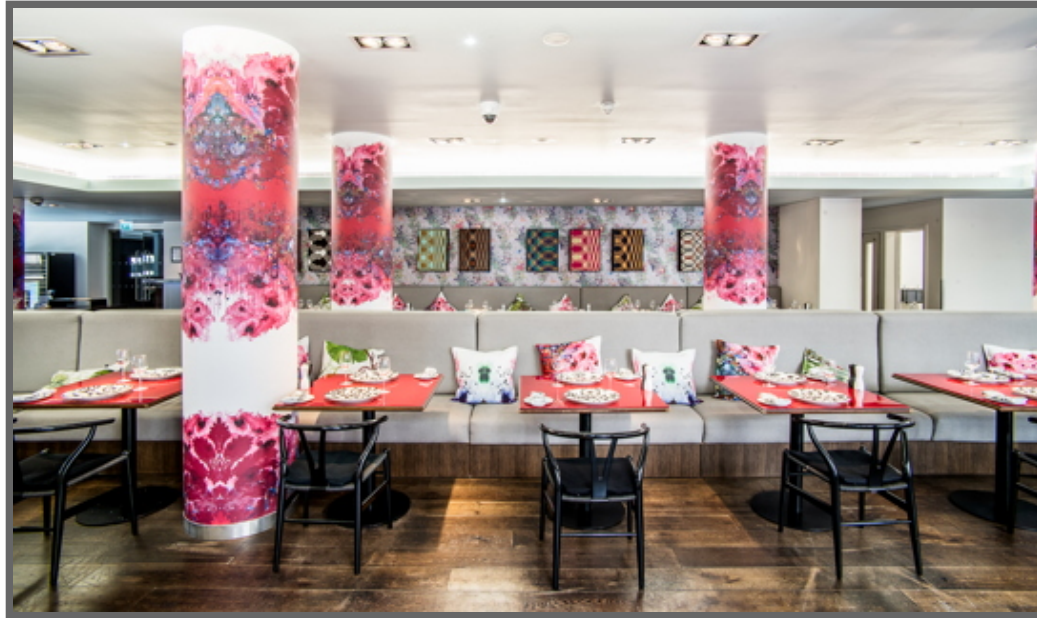
Cucina at G&V has a stylish new look.

Aldourie Castle is also excellent for Luxury Corporate Retreats and private celebrations, including exclusive group accommodation during Christmas and New Year, when the house is seasonally decorated.